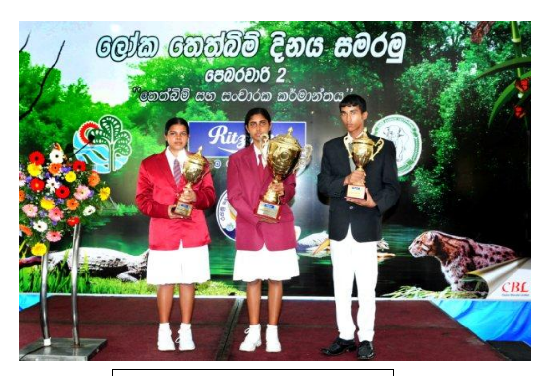
Prize Winners at the National Level