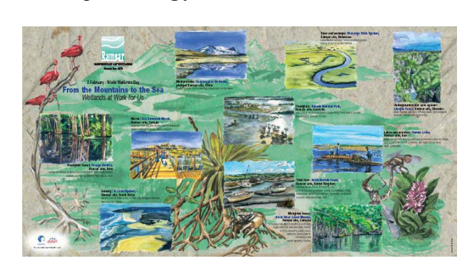
Ramsar's Wetlands Poster - 2004

This year World Wetlands Day was commemorated under the theme "From Mountains to the Sea – Wetlands at Work for Us". This year we decided to combine our resources and commemorate World Wetlands Day jointly with World Water Day, which theme for this year is "Water and Disasters", and we slightly modified the themes for the two days to reflect this joint commemoration as "Celebrating Water – wetlands at work for us in their role in preventing flood disasters".