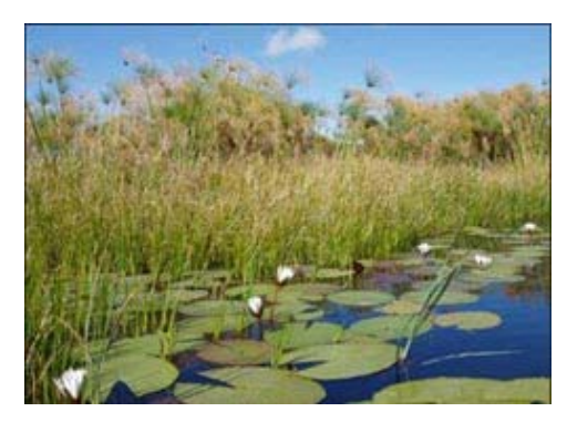
Vegetation of the OkavangoRiver

The day is commemorated to raise awareness and promote the wise use of our wetland, to draw attention to the values and benefits that we derive from our wetlands and to enhance the peoples understanding and shared responsibility for wetlands. Wetlands provide us with natural resources such as the water we drink and use in agriculture, industries, etc., the vegetation we use as food, medicines, building material, etc., the animals, such as marine and freshwater fish that we eat and