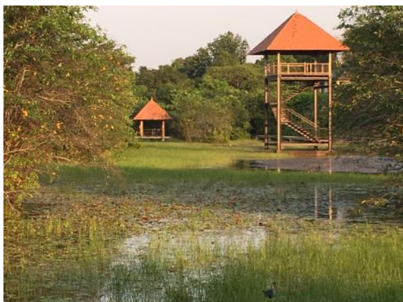
Beddagana Wetland Park

Please bring along standard fieldtrip clothing and equipment for bird-watching and walking on these field trips, such as binocular, rainwear, camera, walking-boot/shoes, hat, drinking water, sun cream and insect repellent.