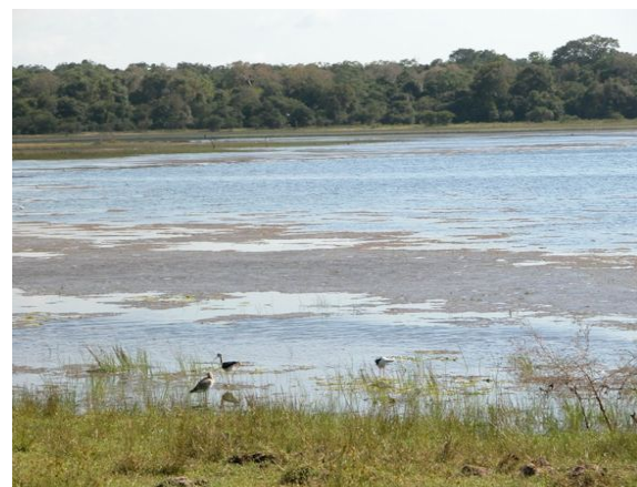
Wilpattu Ramsar Wetland Cluster