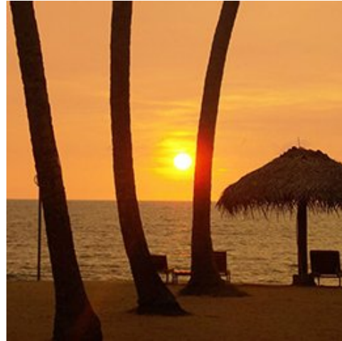
Carolina Beach Resort