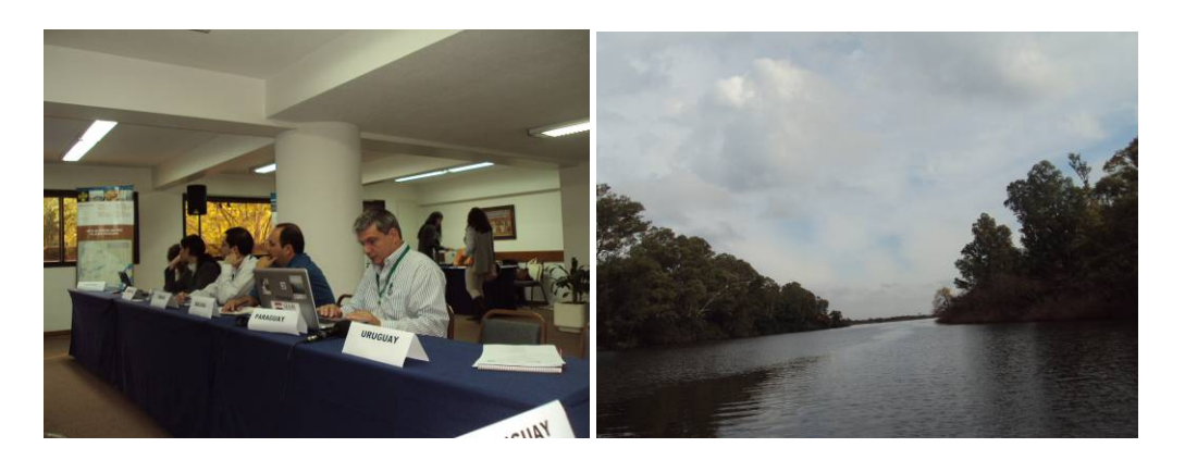
II Meeting, Montevideo Uruguay