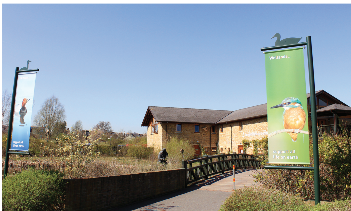
WWT London Wetland Centre entrance

The development and sensitive siting of a wetland education centre offers the opportunity to the organisation to demonstrate innovation and to 'practice what they preach'. If impacts are absolutely unavoidable and mitigation is required then the cost of mitigation must be offset against not just the benefits associated with reducing the impact but also the chance to use the mitigation as a learning and communication opportunity. Such innovation could include creating wetlands to mitigate against flood risks or to treat wastewater, designing green roofs to provide habitat or to insulate buildings, developing floating or stilted buildings to mitigate against flooding or to facilitate construction in a floodplain, or sensitively designing windows with overhangs and blinds to minimise reflection of the sky and to reduce risks of bird strikes. All of these approaches translate into conservation messages in their own right (see Chapter 5).