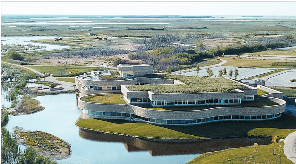
Aerial view of Oak Hammock Marsh Interpretive Centre, Canada

waste and pollution that even the best intentioned centre will generate not impact upon sensitive wildlife? All these tensions, and more, require consideration.