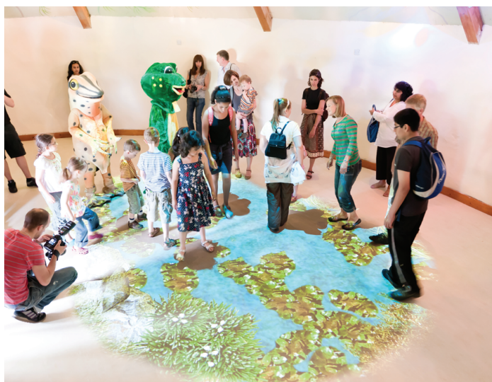
WWT interactive pond game