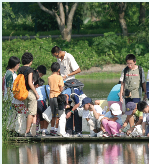
Students learning on boardwalk