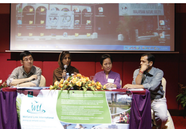
Delegates lead a debate at the 3rd WLI Asia meeting, Malaysia