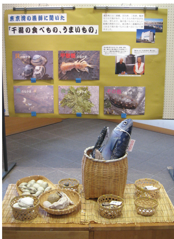
Educational display at the Yatsu-higata Ramsar Site, Japan