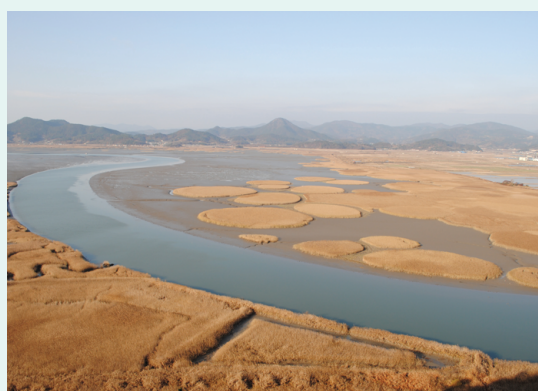
View of Suncheon Bay

Suncheon Bay is a Ramsar Site located in the middle of southern coast of Korea. The first wetland centre in the bay, Suncheon Bay Ecological Park, was opened in November, 2004. As the physical facilities expanded to meet the need of growing visitor numbers, the centre became a challenge to the natural characteristic of the Suncheon Bay ecosystem. To conserve the core area of Suncheon Bay Ramsar Site from heavy disturbance, Suncheon City decided to relocate the wetland centre into an area behind the bay. The new location for the wetland centre was selected through a zoning process of the protected area, which also reflected the city's approach to urban planning. Taking six years to build and costing approximately US$41 million, Suncheon Bay International Wetland Centre was opened in 2012.