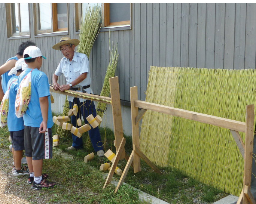
Volunteers making reed screen in Miyajimanuma, Japan

The ambition of any centre should be more than just to have a certain number of volunteers. The aim should be to grow the numbers and types of volunteers and to enthuse them. Different things will motivate different volunteers. Creating the right working conditions and environment are crucial. But all volunteers are individuals exerting an individual choice. Understanding personal motivations is vital if a centre is to get the most out of these dedicated individuals.