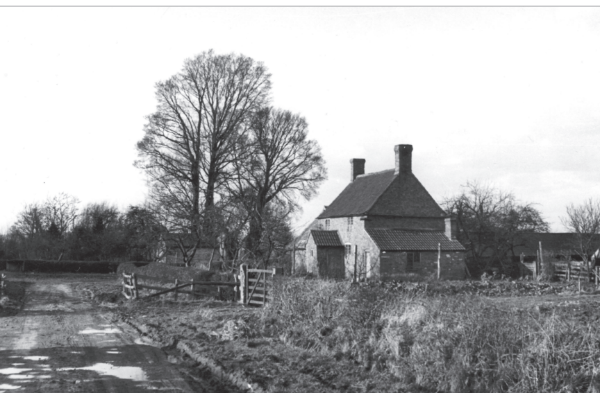
WWT Slimbridge very early beginnings, 1946

Some wetland education centres have a long history going back over half a century. For instance, the Wildfowl & Wetlands Trust's (WWT) headquarters at Slimbridge, UK, has been bringing people and wildlife together since 1946 and the National Audubon Society in the USA established their first centre, the Theodore Roosevelt Sanctuary & Audubon Centre, close to New York on Oyster Bay, in 1923.