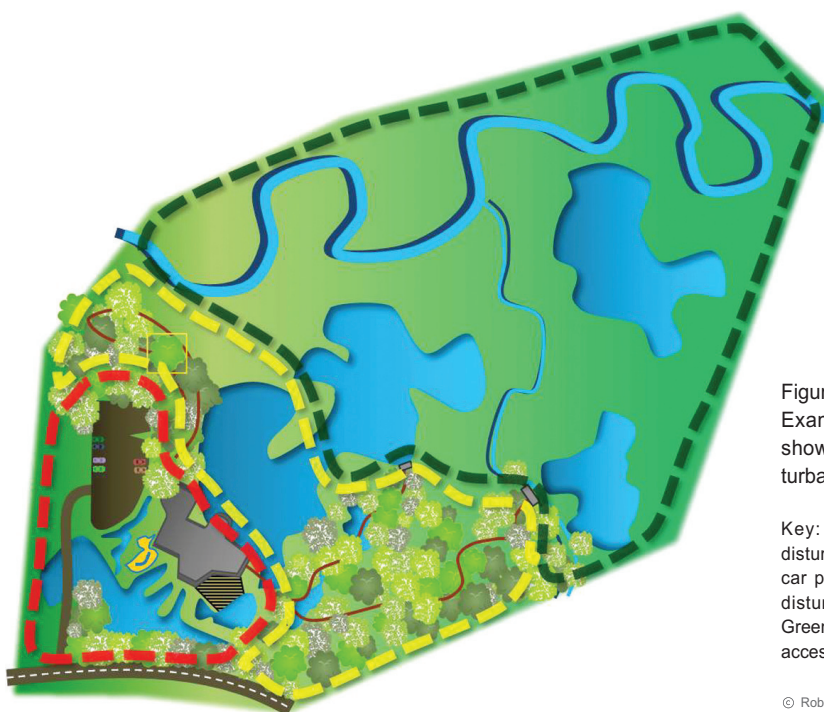
Figure 4.1 Example of a wetland education centre showing areas of different levels of disturbance

Within a zoning scheme it may also be possible to establish buffer zones which protect areas from disturbance. Native tree planting or scrub can be used as natural barriers and can also provide valuable habitats for wildlife. Understanding which types of visitors will be moving around different parts of the centre is crucial. Access routes, paths, boardwalks and the overall flow of visitors around the centre need to be considered when integrating disturbance zones. Maintenance access for both built and natural elements of the centre also need to be considered to ensure that movements of horticultural and maintenance machinery do not impact on visitors or wildlife.