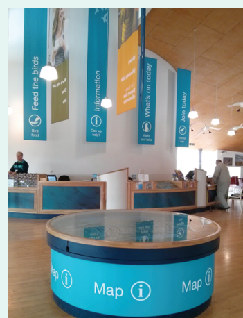
WWT Slimbridge foyer redevelopment 2014

Key findings were that: the ticket desk was too far from the entrance doors, leaving a large area of 'dead space'; the foyer space itself was too big with implications for noise, comfort and intimidation; and the signage was confusing and not sufficient to guide visitors to the ticket desk. Changes started with signage in the carpark and along the entrance ramp to the building, so that visitors understand about WWT and what to expect at the wetland centre; opening times, prices and information about membership are provided up front and bright images provide an indication of what to expect inside. Inside the building, the ticket desk has been brought forward, with multiple tills to reduce queues and a separate members' desk for fast entry. Once past the tills, visitors can now start their experience; large, colourful banners indicate the activities on offer and direct visitors to the appropriate area whilst a 3D map of the site and staffed information desk provide further orientation, a new cafe provides a place to relax if waiting for friends or wanting to decide on a programme for the day, and the rest of the large foyer can now be used to host temporary exhibitions to provide changeable interpretation.