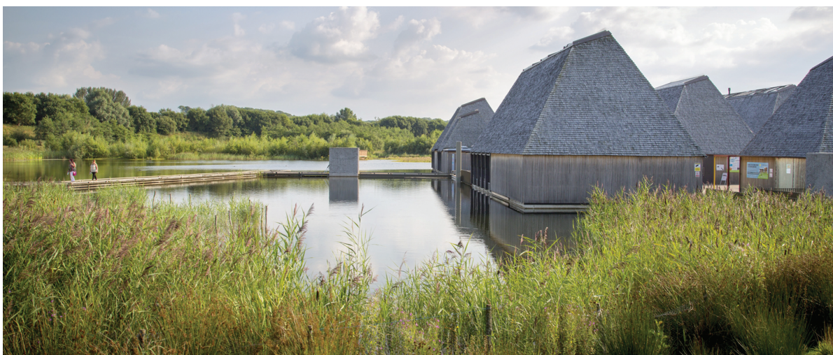
Visitor Village in Brockholes Nature Reserve

Wetland education centres can be great learning environments and a gateway for people to get close to wetlands. An aspiration of learning at any wetland education centre should be to give people the information and knowledge necessary to make informed decisions about their local environments and to help deliver wetland conservation and wise use. The 'education' provided by a wetland education centre should not be seen as purely a formal process for schools and colleges but rather it should also be considered as part of a process for everyone, from children to adults.