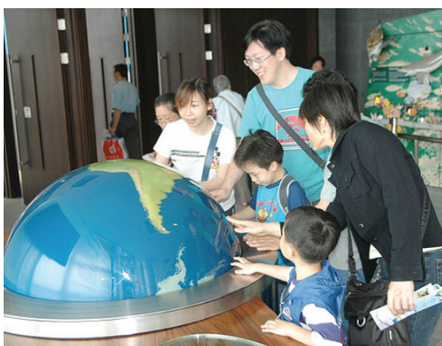
The Globe exhibit at Hong Kong

Irrespective of the category, people visit wetland education centres primarily for leisure and pleasure. This is entirely compatible with learning. Indeed, all these different groups will learn more if they are enjoying the experience. This enjoyment will be increased if the interpretative experience is diverse to allow different visitor types to learn in their own way. For instance, some visitors may wander quickly around the centre stopping momentarily to look at the headline of some label, others they may stop a little longer at selected places, or they may linger and absorb interpretation in detail.