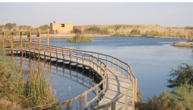
Azraq Wetland Reserve managed by the Royal Society for the Conservation of Nature (Jordan)

Wetland education centres can be managed by governments, non-governmental organisations, private individuals and companies, or by any combination of these organisations through partnerships. They may be small centres dependent on civil society volunteers or expensive projects receiving backing from a central or local government.