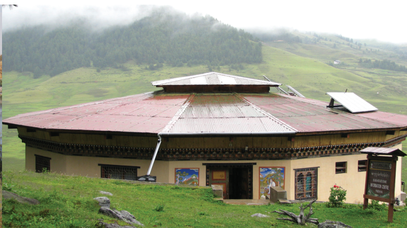
Information Centre managed by the Royal Society for the Protection of Nature (RSPN) at the Phobjikha Conservation Area (Bhutan)