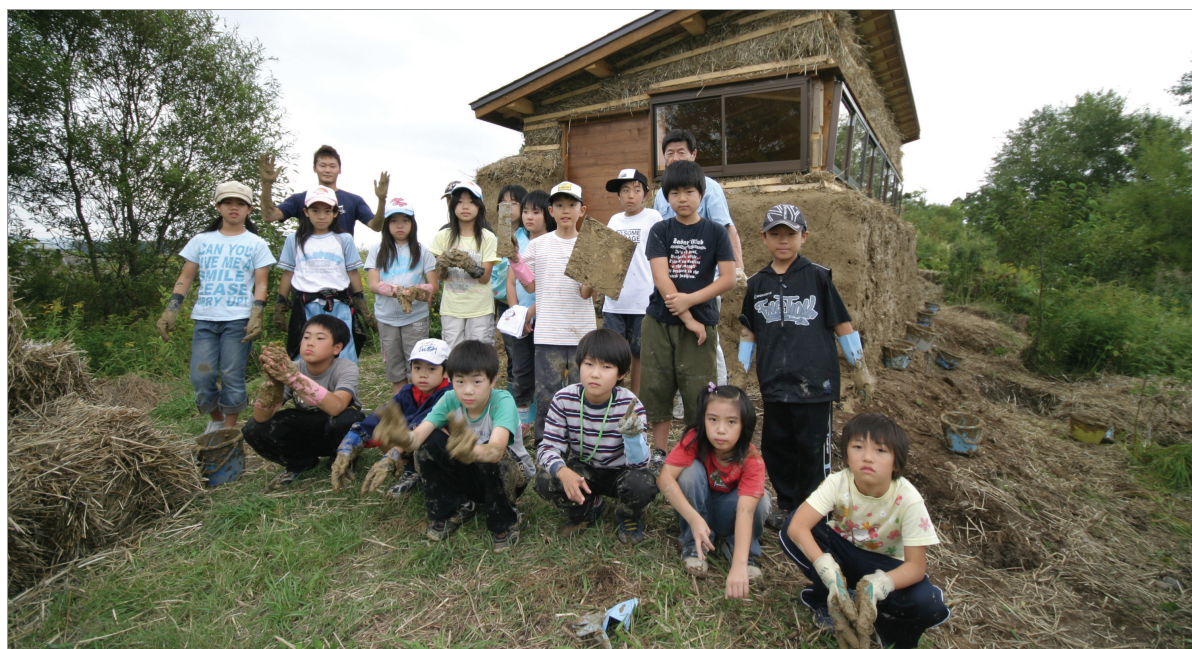
Volunteers making a hide in Miyajimanuma, Japan