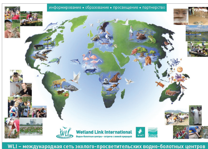
Russian version of the WLI Brochure

requested to support and participate in the global (and developing regional and national) network of such centres under the WLI programme. The objective of WLI is to build a network in order to help organisations throughout the world to develop new, and enhance existing, wetland education centres. Further information can be found at http://wli.wwt.org.uk