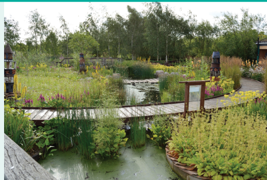
Rain garden in London Wetland Centre

All nine Wildfowl & Wetlands Trust (WWT) visitor centres in the UK have integrated wetland treatment systems and sustainable drainage systems (SuDS). Wetland treatment systems (or constructed wetlands) make use of the natural cleansing properties of wetlands to treat a variety of pollutants, including sewage, to a level suitable for safe discharge to the environment. SuDS employ the same principles to manage runoff from buildings and hard surfaces and provide a level of treatment. As part of natural water management, WWT also has Rain Gardens which work with nature to harvest valuable water and store it for drier times. The benefits are multiple including: