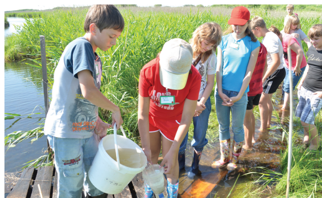
Environmental school at Muraviovka Park, Russia

The visitor's learning experience needs to be planned, shaped