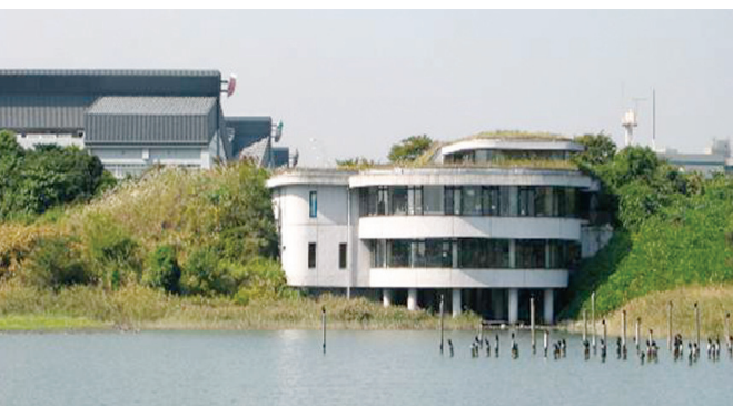
Tokyo Port Wild Bird Park

It is important to consider the timing of some habitat integration works. In order to allow habitats to become established and to mature, sometimes the creation or restoration of wetlands and associated ecosystems might need to be completed well in advance of building works. In other cases seasonal disturbance to sensitive habitats might limit the opportunities for undertaking certain development activities.