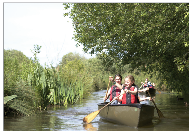
WWT canoe safari

Often the wildlife spectacle at a wetland education centre is a seasonal event. During the times of significant wildlife interest the income from increased visitation might contribute to a significant portion of the annual revenue. However, good financial management needs to ensure that the budgets can cope with the seasonality and times of lower wildlife interest can be used for other activities which will both generate funds and also not impact upon the core nature experience, or on those who are coming to the centre to enjoy it. Similarly, targeting school holiday periods with seasonal events such as daytime childcare camps or activity days can increase seasonal income, or putting on events to coincide with religious or cultural festivals. In some extreme climatic conditions, such as during harsh winters, it can be worth considering a temporary shut-down when visitors are excluded. For sites that experience hot, dry seasons, consideration should be given to holding events in the evening when it is cooler, such as star-gazing or watching wildlife such as bats or fire-flies. Periods of limited visitation can also be used to undertake maintenance, such as decorating areas or updating exhibits, which would otherwise be difficult to undertake with visitors present. This approach also allows for a seasonal ‘re-launch’ marketing campaign to reinvigorate interest from the repeat visitor.