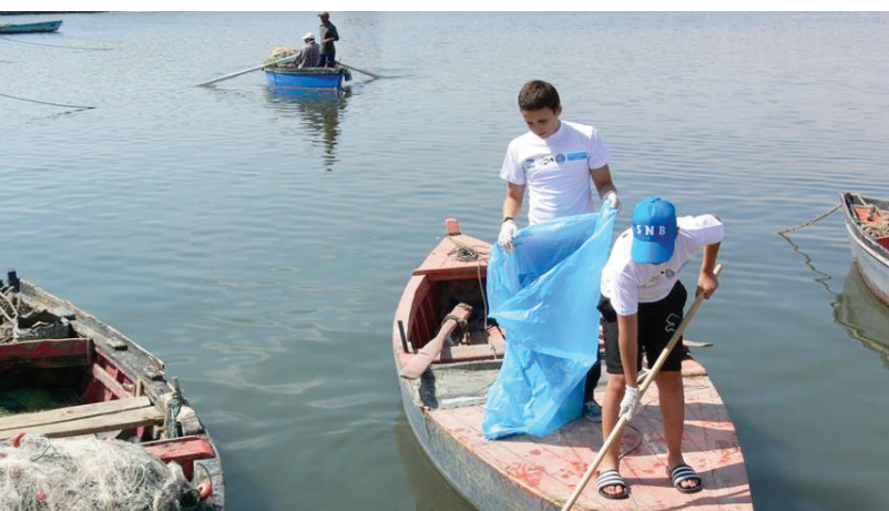
Volunteer school pupils cleaning the ghar el melah lagoon, Tunisia

While wetland conservation should be the primary remit of the centre, many environmental issues are related to the long-term sustainability of the planet's resources. Making daily operations reflect sustainability issues should be the goal of any well-run centre, even if it is just stopping a dripping tap or turning off a light.