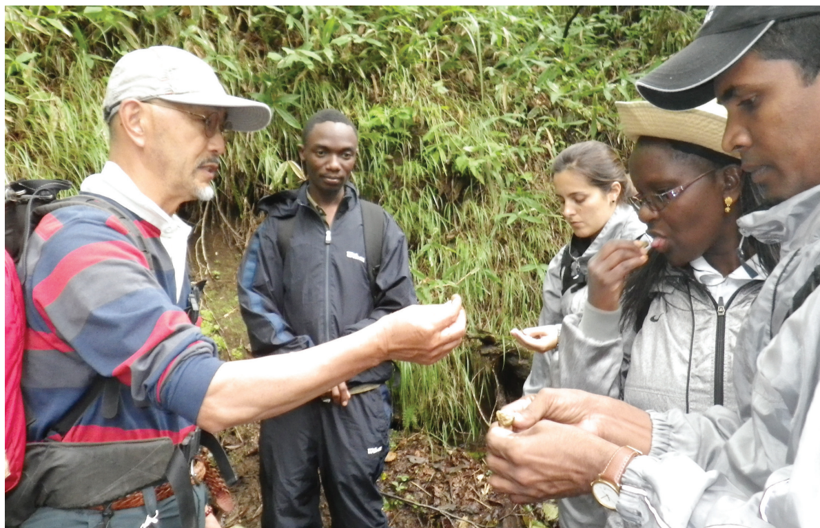
Training programme on ecotourism (Kushiro-shitsugen Wetland)