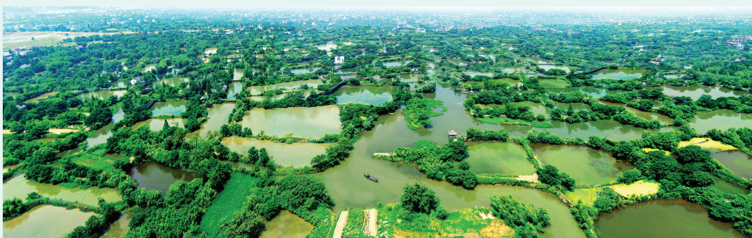
Landscape of Xixi Wetland

More information: http://www.xixiwetland.com.cn and http://www.cnwm.org