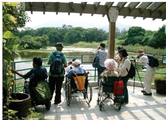
Wetland centres should be accessible for a wide range of visitors © Lew Young

Care should be taken in the design and planning stage to understand the local context of these issues (see Chapter 2). For instance, from a landscape architectural perspective it might be desirable to create pathways out of stone slabs and gravel but from the perspective of parents pushing children in buggies or wheelchair users this could be difficult to access. Similarly, creating complex and attractive interpretation will work for many visitors but equal provision needs to be made for the visually impaired (see Chapter 5). In such a scenario consider using tactile models and signage and the use of braille or recorded information.