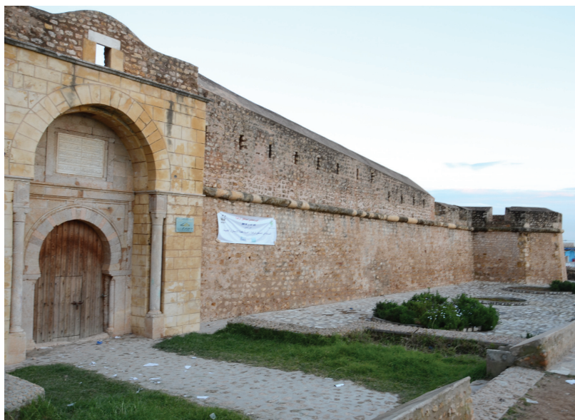
The Ottoman Forts hosting the Wetlands information and education centre of Ghar El Melah, Tunisia.

There is no one model of a wetland education centre. Reflecting the indigenous wildlife, culture and geography of the wetlands associated with each locality, each centre should develop and be adapted to its surroundings in order to engage with visitors and to raise awareness of the importance of wetland conservation.