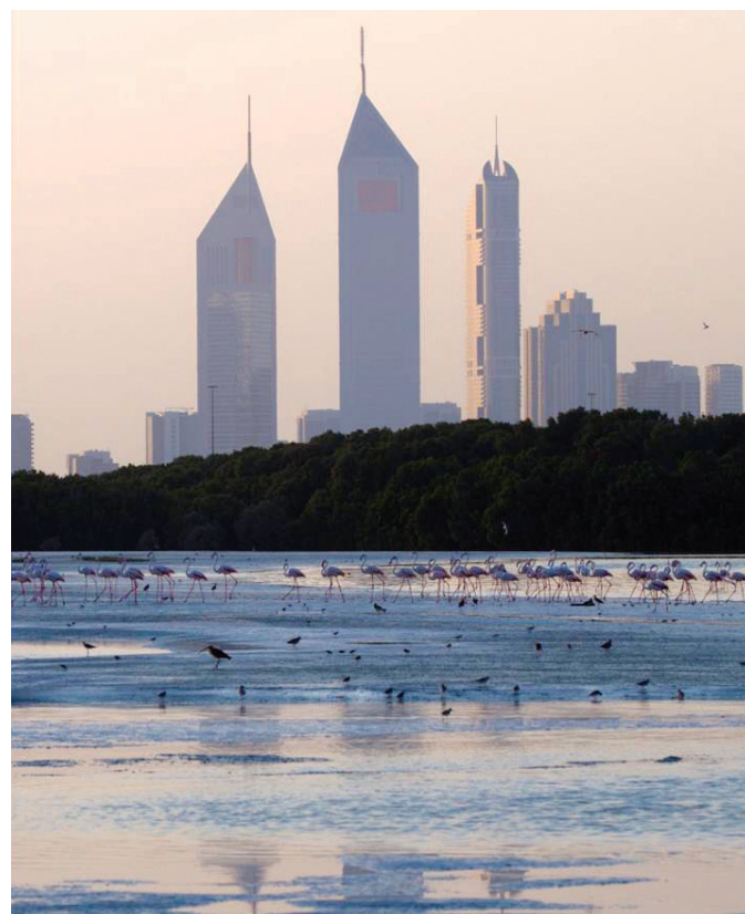
Tidalfat by the Ras Al Khor Ramsar Site, with city skyline of Dubai

Wetlands and their associated habitats are fundamental components of a successful wetland education centre (see Chapter 4). They are the core hardware through which learning can be experienced and messages can be conveyed in exciting and evocative ways. While natural wetlands and the wildlife they support can be sensitive to disturbance and will require thoughtful integration, the restoration of degraded wetlands and creation of new wetlands can provide opportunities for engagement and the development of learning experiences, such as canoe safaris or pond dipping. Wetlands can be integrated into the building design, for instance to treat wastewater or to manage the risk of flooding, or created to improve landscape aesthetics and to create iconic views of built structures that integrate well into the site.