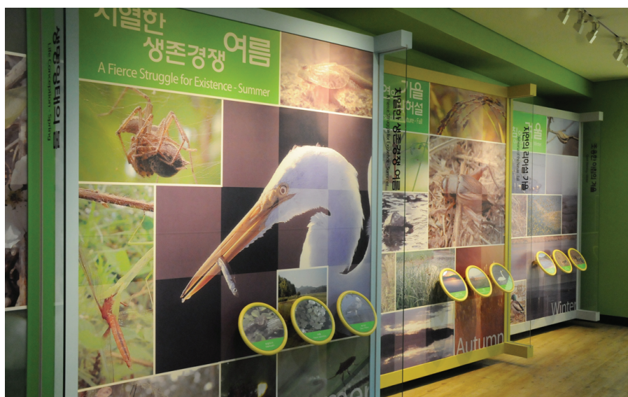
Exhibition Hall of Upo Ecological Park, R.O.Korea

The following principles can be used to guide the design and delivery of all interpretative elements within a wetland education centre. They are of equal importance and form the basis of the standards against which the effectiveness of interpretation can be measured.