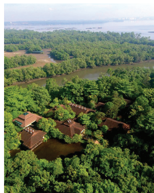
Sungei Buloh Wetland Reserve, Singapore