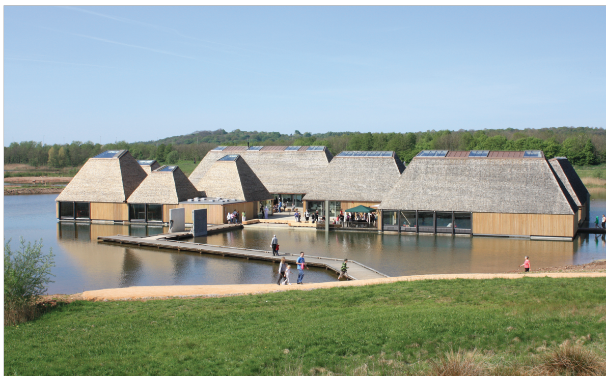
Visitor Village in Brockholes Nature Reserve

Potentially a centre may have areas which are open for free to the public and other areas which are within a 'pay zone' where admission is charged (see Chapter 3). The relative impact of visitors within these different zones also needs to be included within the zoning and carrying capacity assessments. Any changes in the relative differences in pay zones and open access areas need to be translated back into the business and financial models.