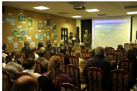
1. Handing in prizes for first places.