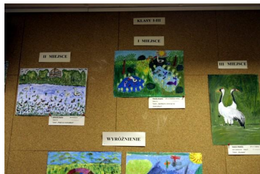
2. "Postcard from the Wetland" - winners