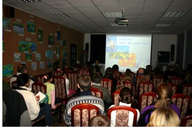
5. ... and his lecture

After this interesting and fascinating lecture we have invited all our guests for a guided excursion to the nearest place where we could watch birds and their behaviour. Each participant got binoculars, both guides took also couple of telescopes. The excursion lasted approximately two hours and was enthusiastically received. People were really excited to watch many rare as well as the well known/common birds species living in this area.