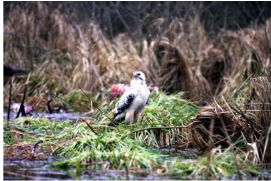
5. Birdwatching in Warta Mouth National Park

We noticed that many people who spent almost the whole life near the Park do not know how beautiful and extraordinary terrain is all around them. So, again it became visible that people do not realise that wetlands are one of the most important ecosystems, both for humans and for the wildlife. This convinced us to prepare again free wetlands workshops for kids from neighbouring schools. We will be conducting it until the end of February and (what is a good sign) we already have some schools interested in participating in our workshops. In the future we would like to encourage adults to be more involved in this kind of activities. This is our goal for the next year.