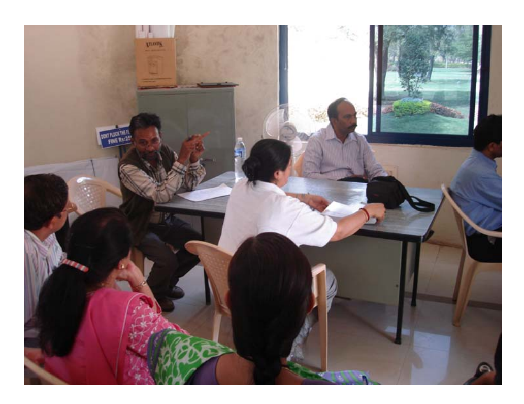
Open Source software training for school teachers