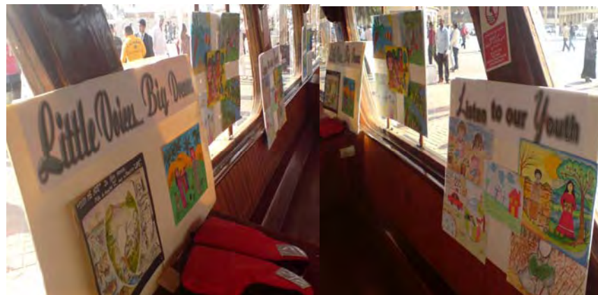
Poster Art exhibits