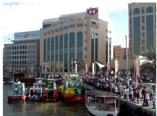
The crowd assemble at the Dubai Creek bank as they watch the demonstration.

The celebration commenced at 4 PM by a procession of the municipality boats that ended up to the Shindagha Abra Ferry Station where the various demonstrations took place. In addition to the municipality boats, a floating restaurant courtesy of the owner, Mr. Farooq also participated in the parade.