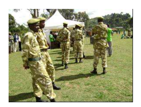
Kws officials looking on