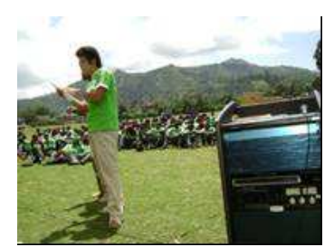
KWS Jica volunteer