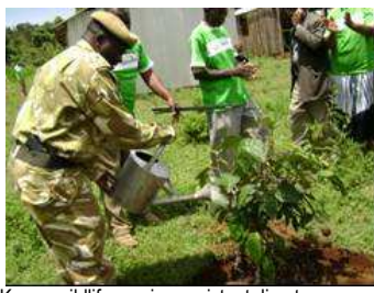
Kenya wildlife service assistant director