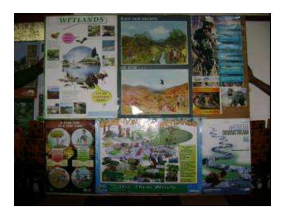
Some of the information posters