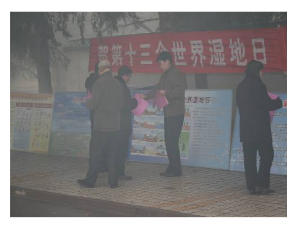
Sanmenxia Wetland Management Department in Henan Province Publicize World Wetlands Day