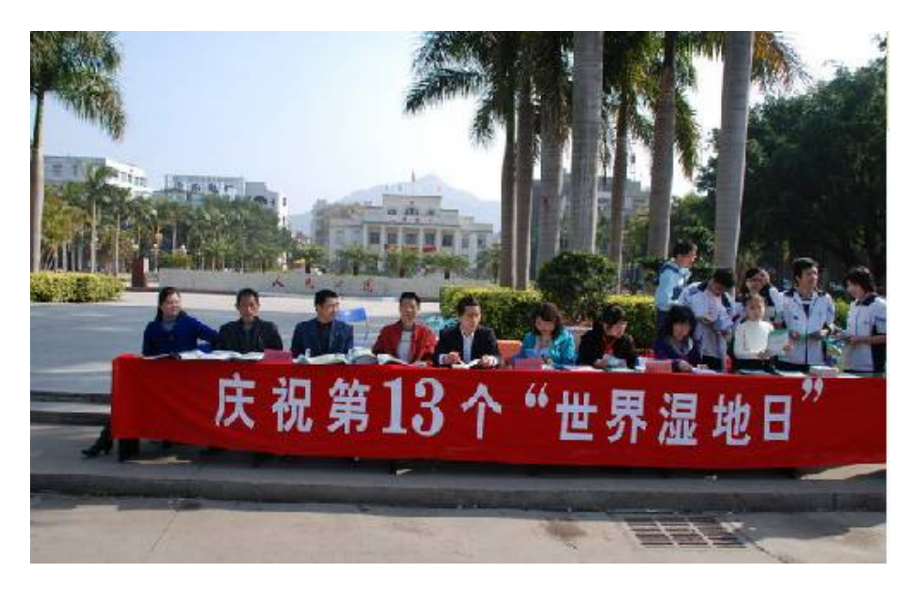
Zhangjiangkou National Nature Reserve in Fujian province held World Wetlands Day Promotional Activities. Pic. 1