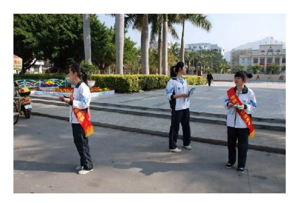
Zhangjiangkou Natinoal Nature Reserve in Fujian province held World Wetlands Day Promotional Activities. Pic. 2