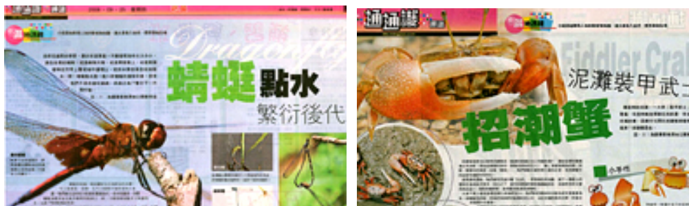
Articles published at local newspapers.