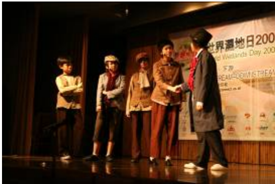
"Oliver" performance by students of Queen Elizabeth School Old Student Association Tong Kwok Wah Secondary School.