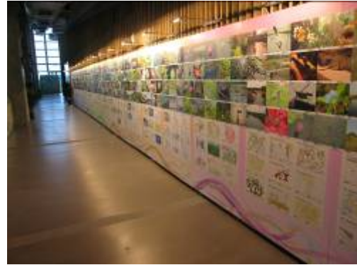
Wetland Art Gallery displayed 800 photos and pictures contributed by the public