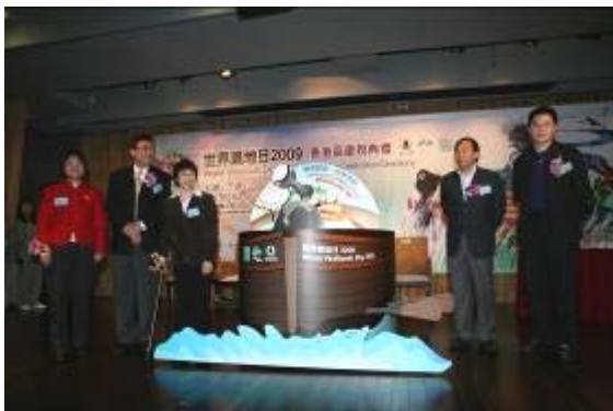
The launch of World Wetlands Day 2009 Hong Kong Celebration Ceremony by officiating guests