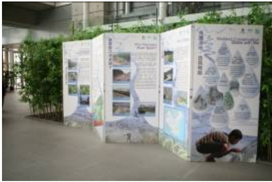
Exhibition on "Upstream - Downstream: Wetlands Connect Us All"