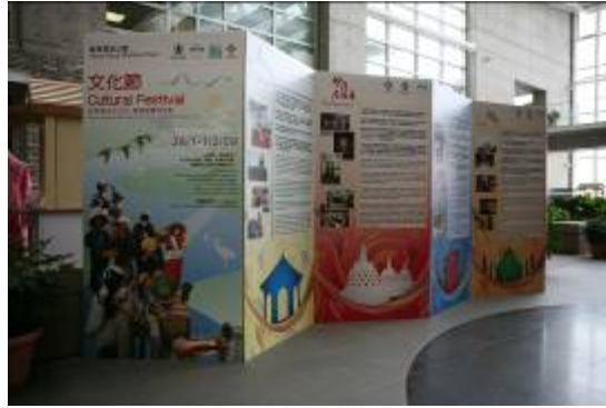
Exhibition on "Cultural Festival"