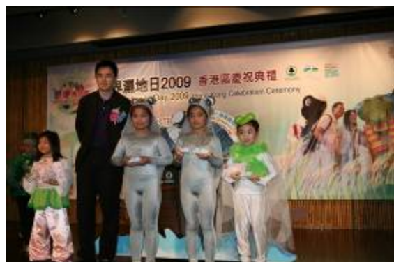
Presentation to winners of storytelling Competition