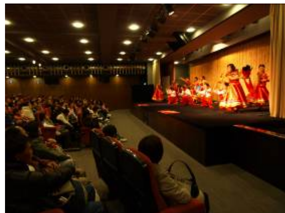
Cultural performance showing the use of wetlands and respect to god