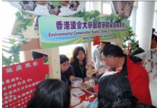
Students of Hong Kong Baptist University designed a game to demonstrate visitors that wetlands provide us food.