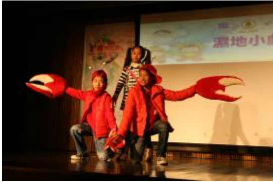
Storytelling session by students