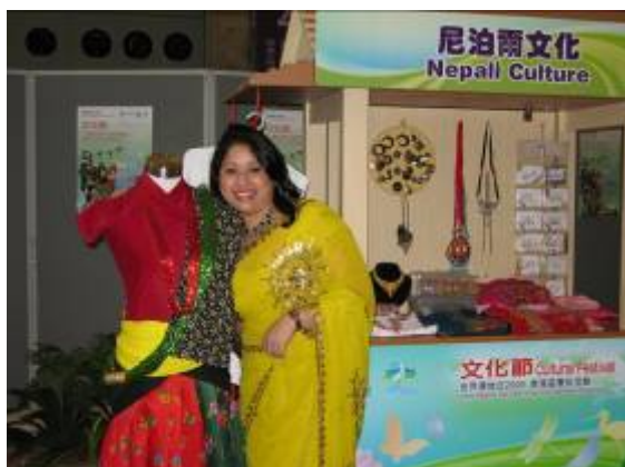
A booth demonstrated culture of Nepal