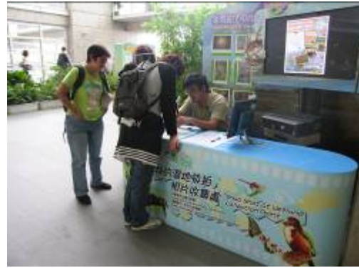
Snap Shot at Wetlands