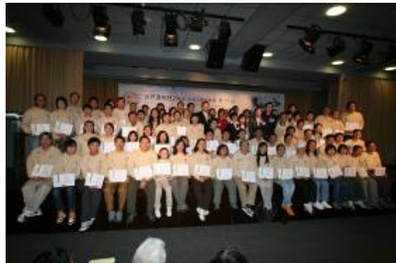
HKWP Volunteers received “Outstanding Volunteer Award”