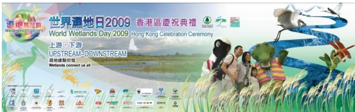
Backdrop for the World Wetlands Day Hong Kong Celebration Ceremony

Apart from the presentation ceremony, visitors could enjoy exhibition stalls as apart of the “Cultural Festival”, performance on drama, “hand-bell” and “Oliver Twist” (excerpt) by students from the kindergarten, primary schools and secondary schools.