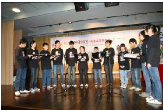
Performance by students