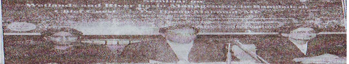
Dr. Hasan Mahmud MP, State Minister for Foreign Affairs speaking at a seminar on 'Wetlands and River basin management in Bangladesh' organised by Nature and Biodiversity Conservation Society (NBCS) at the National Press Club on Monday.