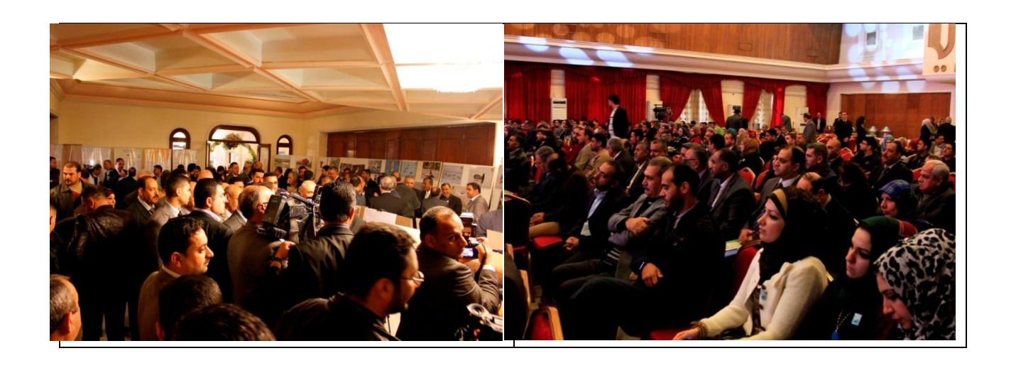
Side of the public who participated in the celebration