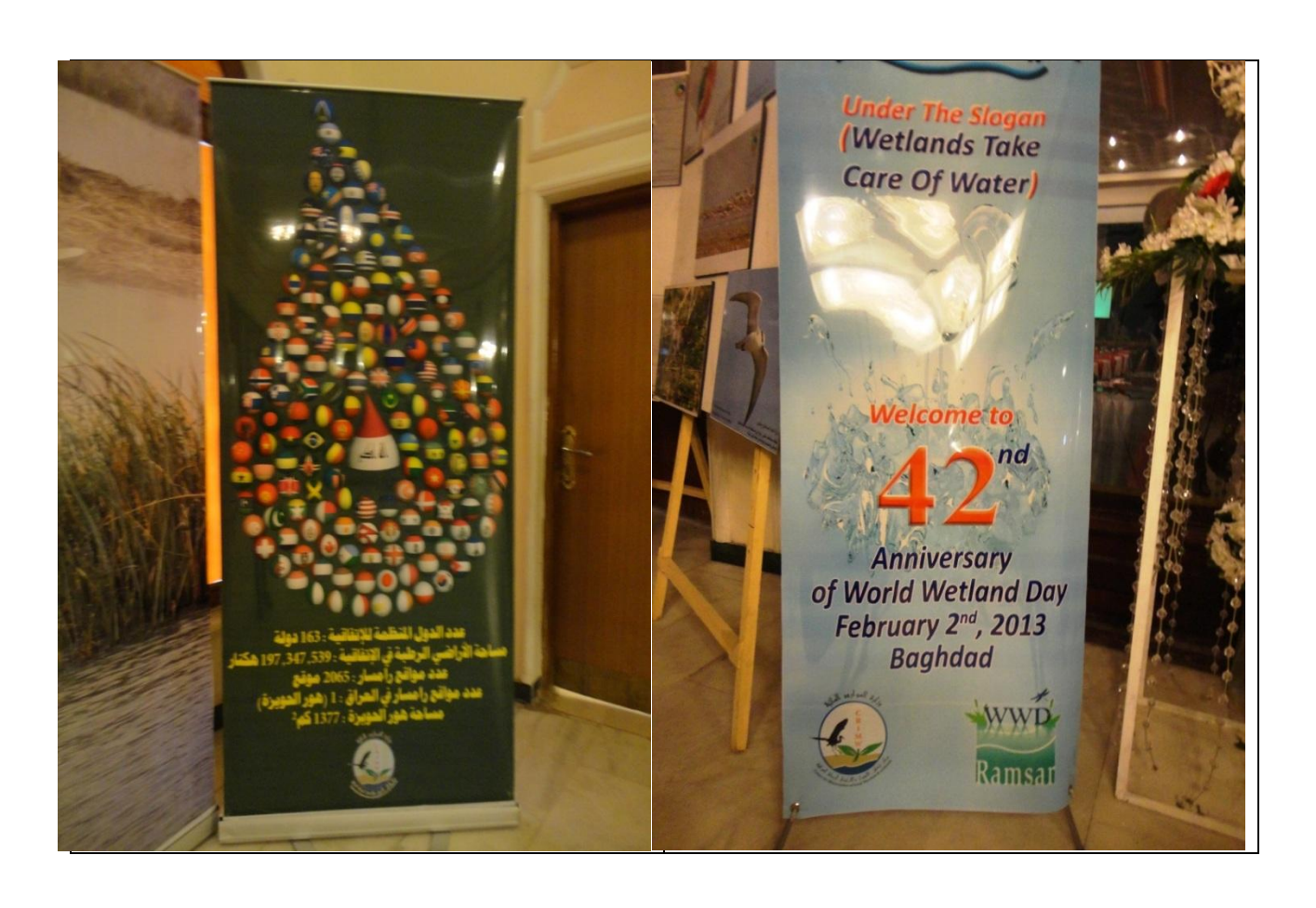
Side of the posters that were distributed in the corridors of the celebration