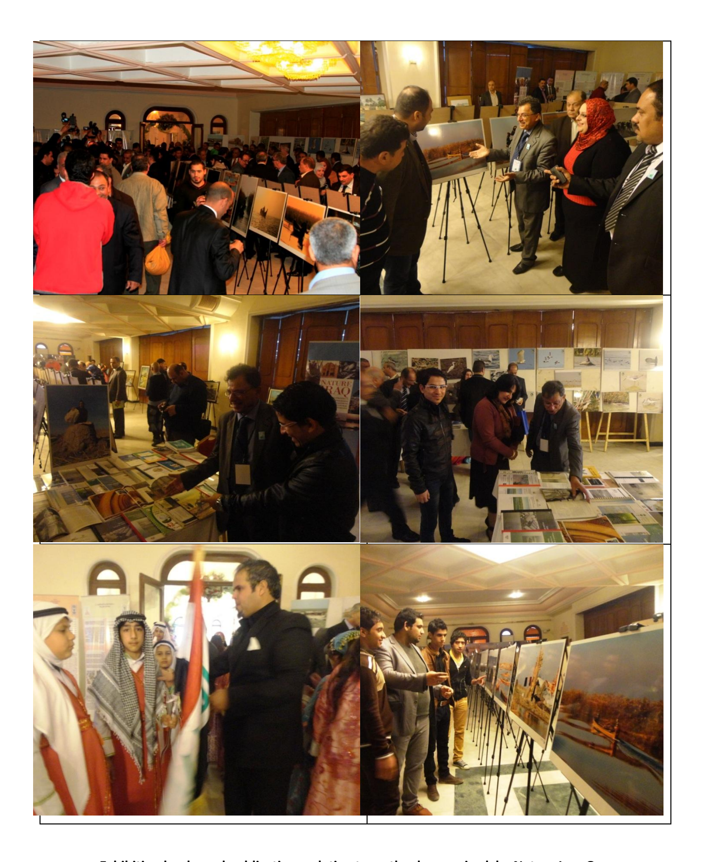
Exhibition books and publications relating to wetlands organized by Nature Iraq Org