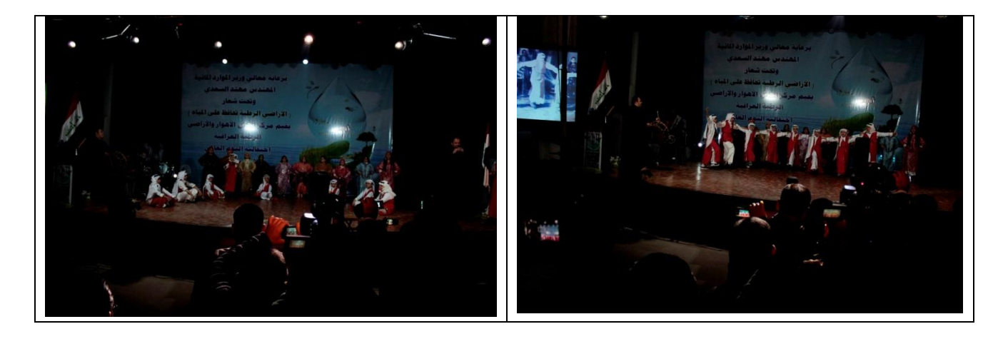
Scenes from paintings dancer in the celebration