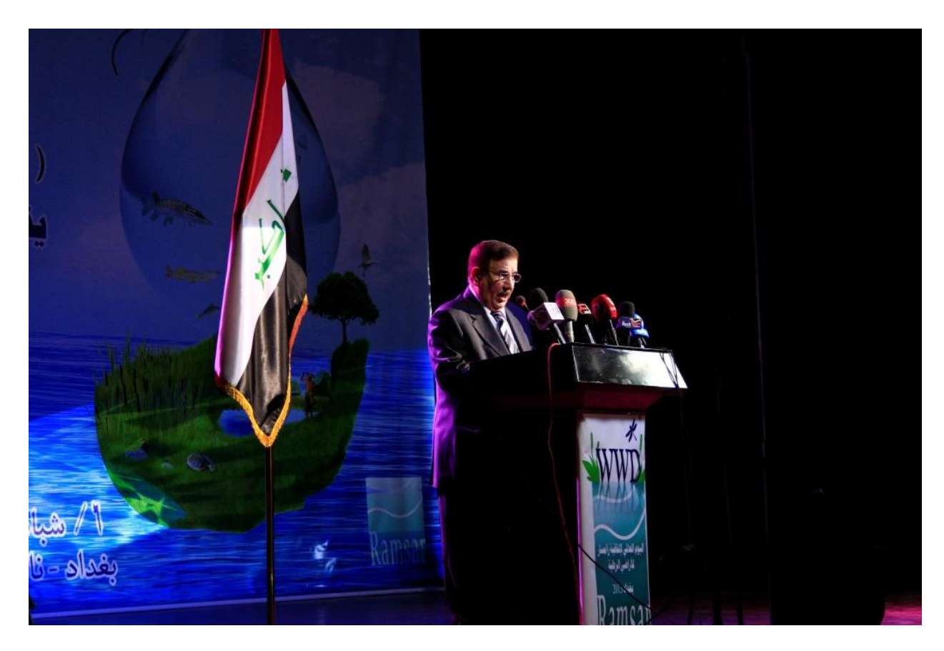
Adviser to the Minister of Water Resources Iraqi minister speech at the celebration