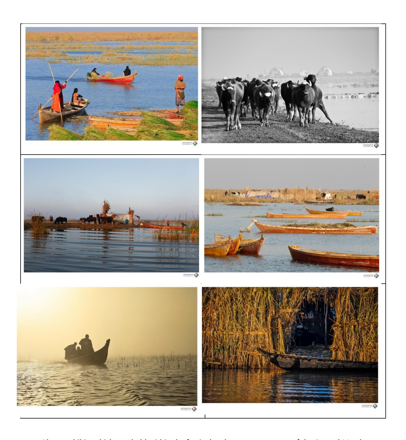
Photo exhibit, which was held within the festival and represent aspects of the Central Marsh