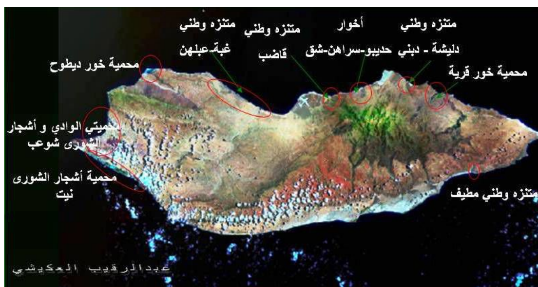
Map 1: showing the important coastal wetlands areas in Socotra Island

Socotra archipelago world heritage site one of the most important biotopes in the world includes several endemic plants and animals. Socotra characterized by several terrestrial and marine habitats. Wetlands is very important components of those habitats represent more than 5% from the total land and divided between wetlands, mangroves, salt march and wadies. Wetlands ecosystems in Socotra is very important because it host several important organisms , several of them located close to the cities, and provide water sources for people .especially in the mountains