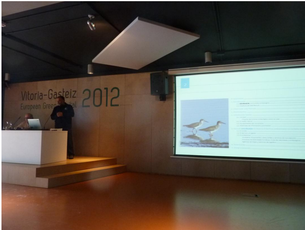
Ramón Martí (SEO/BirdLife) introducing SEO's new manual on good environmental practices in ornithological tourism.