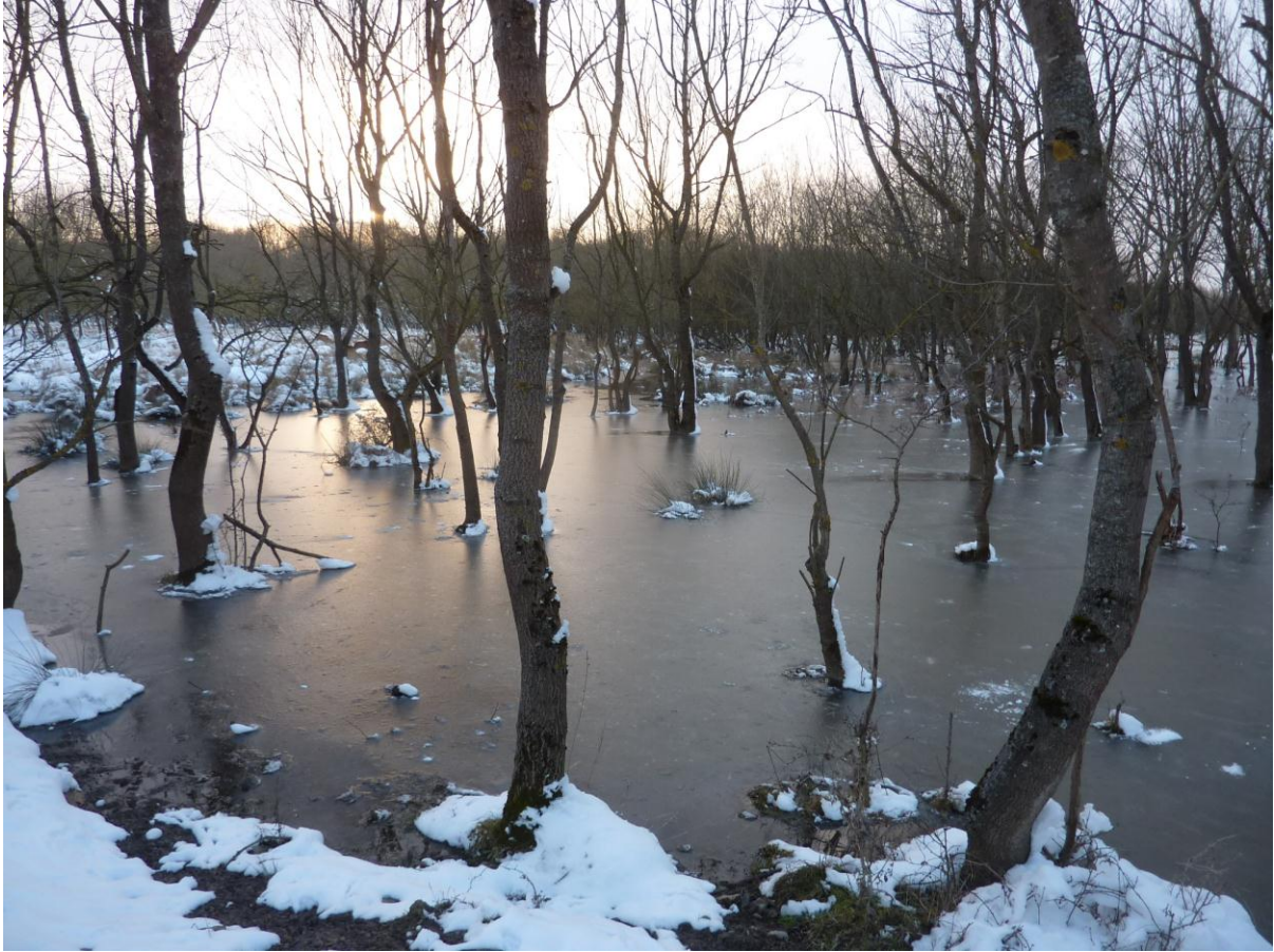
Field visit to the Salburúa Ramsar Site despite the cold weather