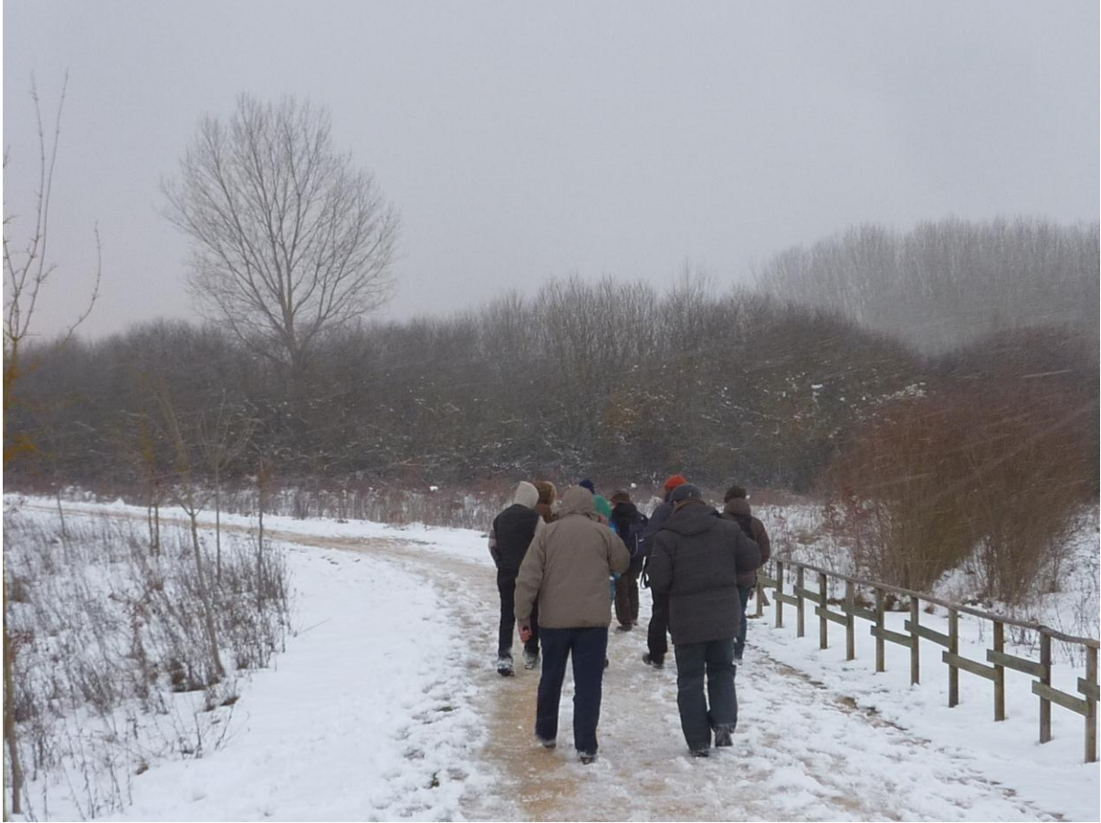
Field visit to the Salburúa Ramsar Site despite the cold weather