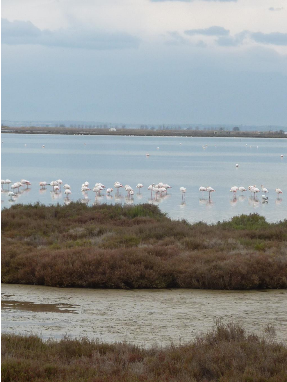
Flamingo colony feeding in shallow water