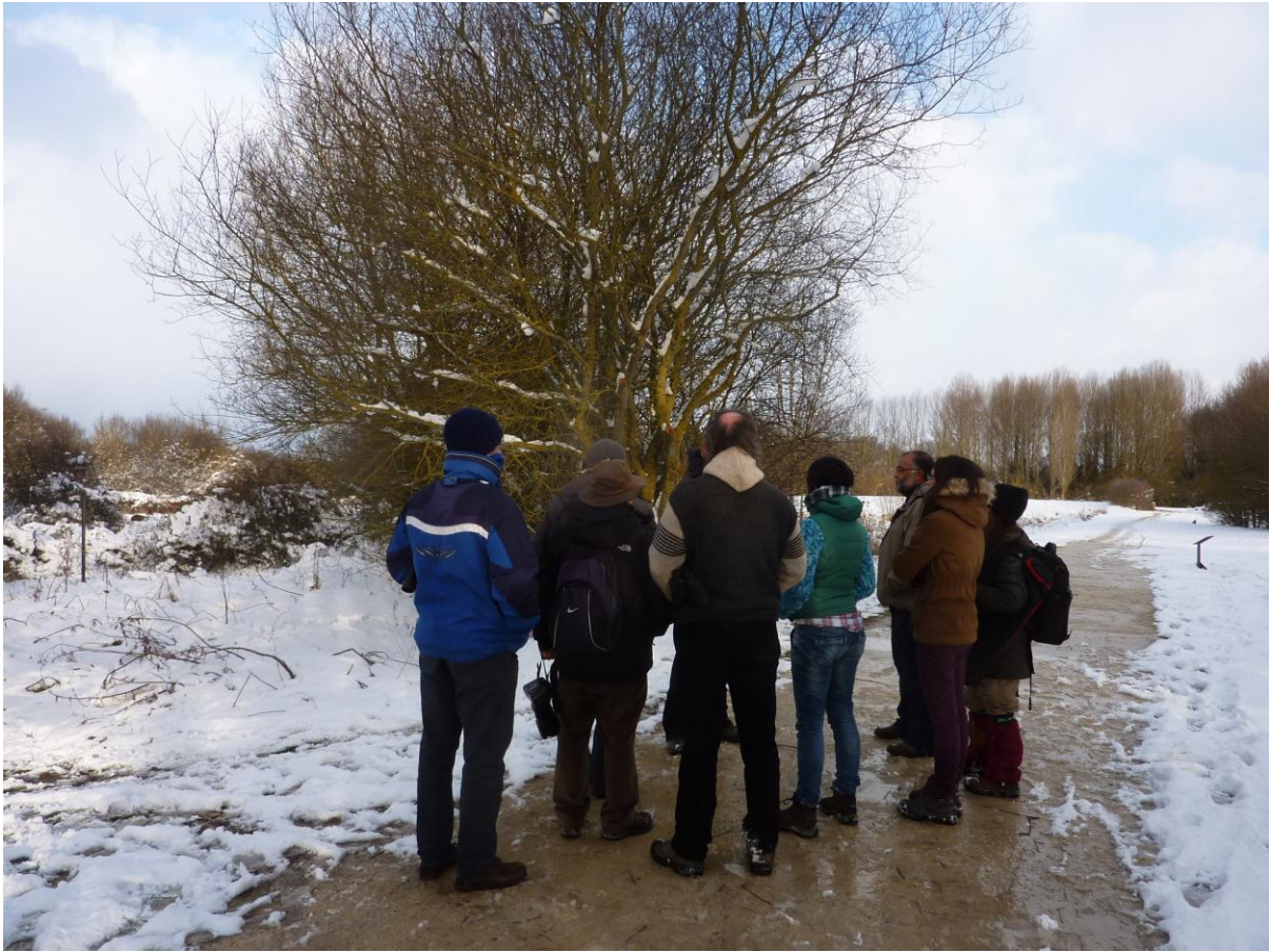
Field visit to the Salburúa Ramsar Site despite the cold weather