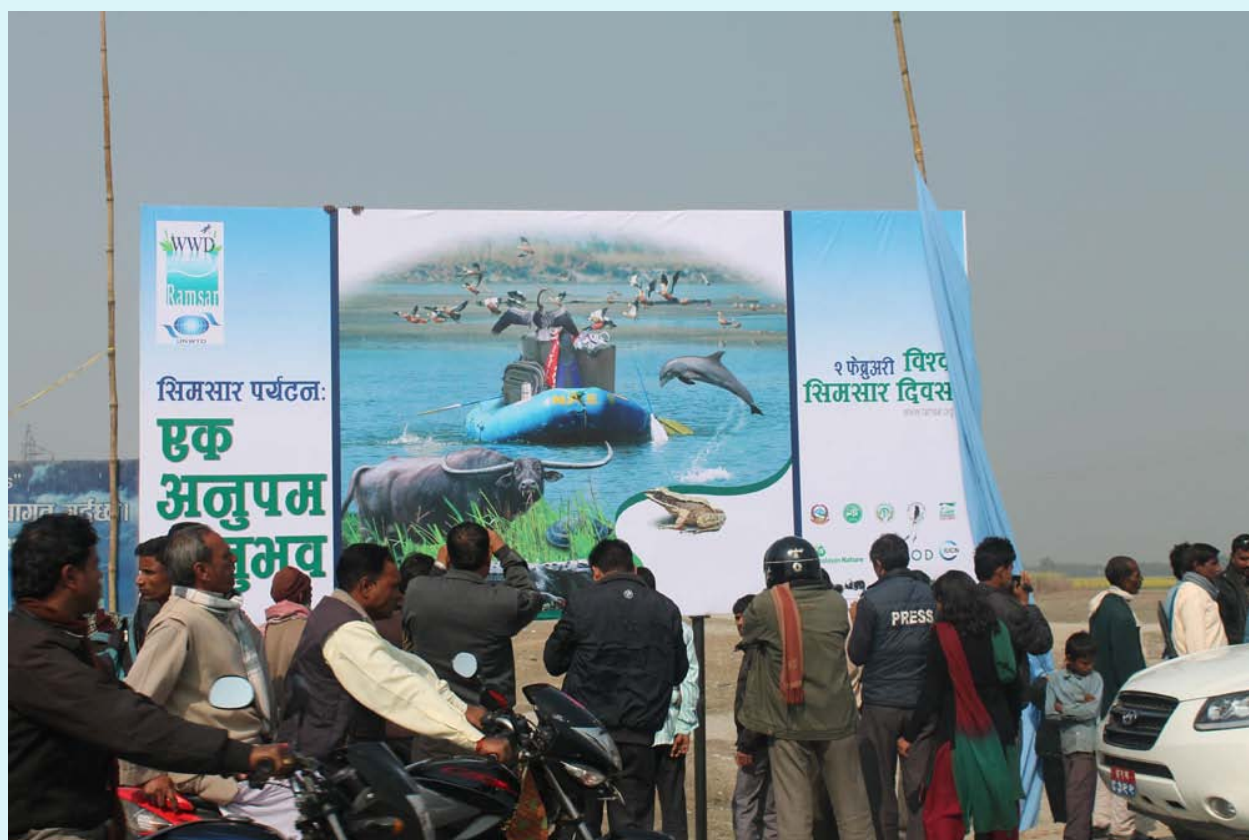
Flex mounted on the WWD 2012 occasion in Koshi area