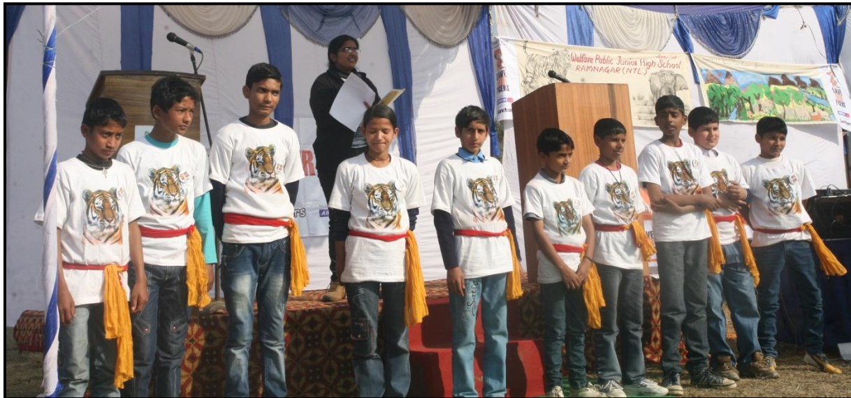
Nukkad Natak Team