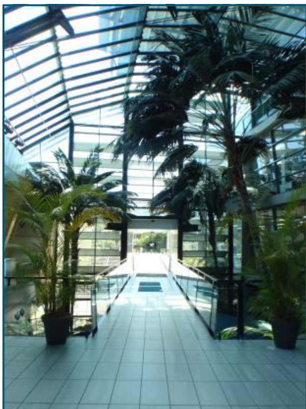
Above: CSIRO Discovery Centre entrance foyer, facing outside