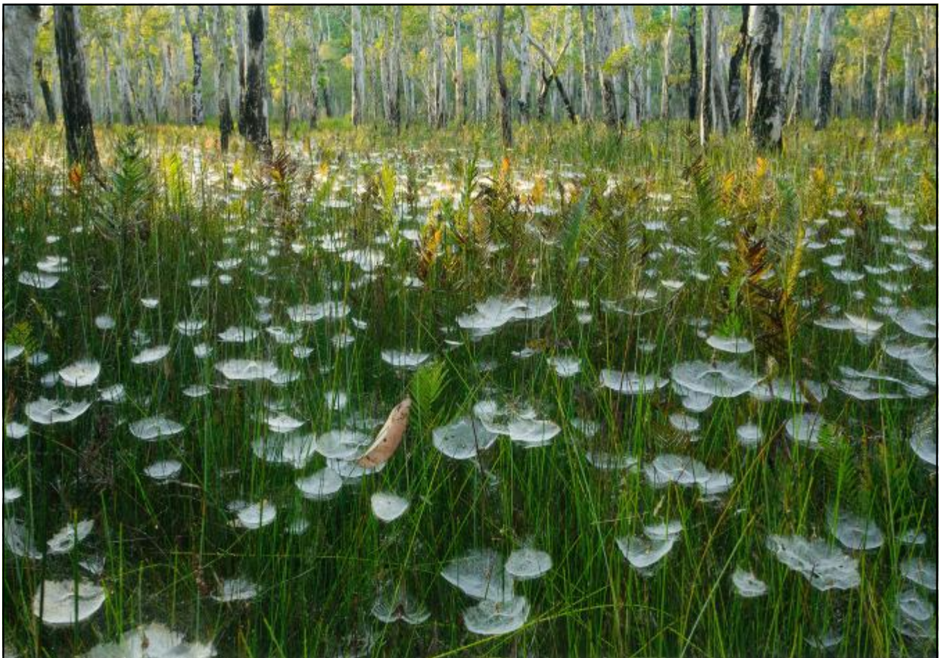
Spiderwebs and paperbark swamp