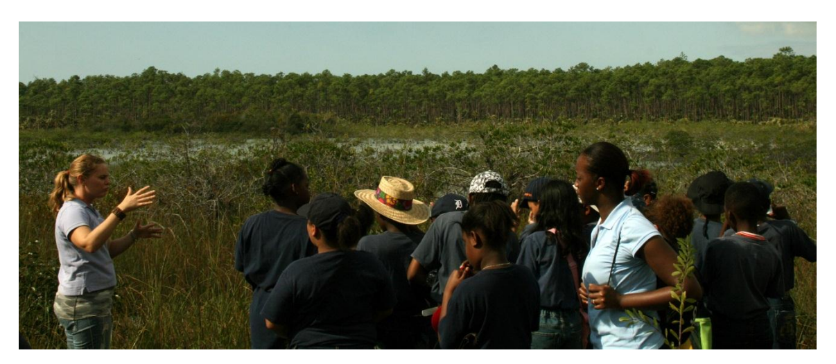
598 students from both Government and Private schools took part in these field trips.