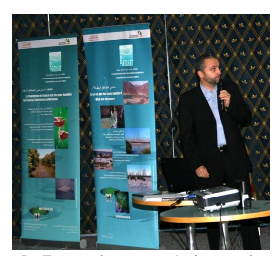
Dr. Tourenq focuses on the impact of climate change to wetlands

the Bird Diversity of the UAE, its status, biodiversity values and its consequence from the impact of climate change. He discussed the integrated approach of the Environment Agency - Abu Dhabi's Bird Programme that entails unique methods in conservation and combating global warming such as bird surveys, monitoring of key and threatened species, monitoring of wetlands sites, focused studies and conservation and networking. From these program components, Dr. Javed point out that they were able to establish baseline data for action planning and generate vital information as inputs to protected area management and monitoring of Avian Influenza. Through intensive studies using satellite tracking programme, Dr. Javed bared that they were able to ascertain the movement and migration pattern of Flamingos which forms part of the valuable knowledge database for conservation planning. He added that the conservation and networking component resulted in