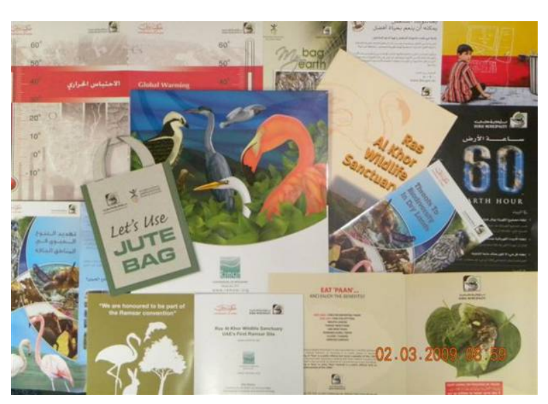
Information and press materials distributed during the Wetland day forum