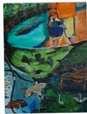
Ajani Denoon Age 10 Speyside Anglican