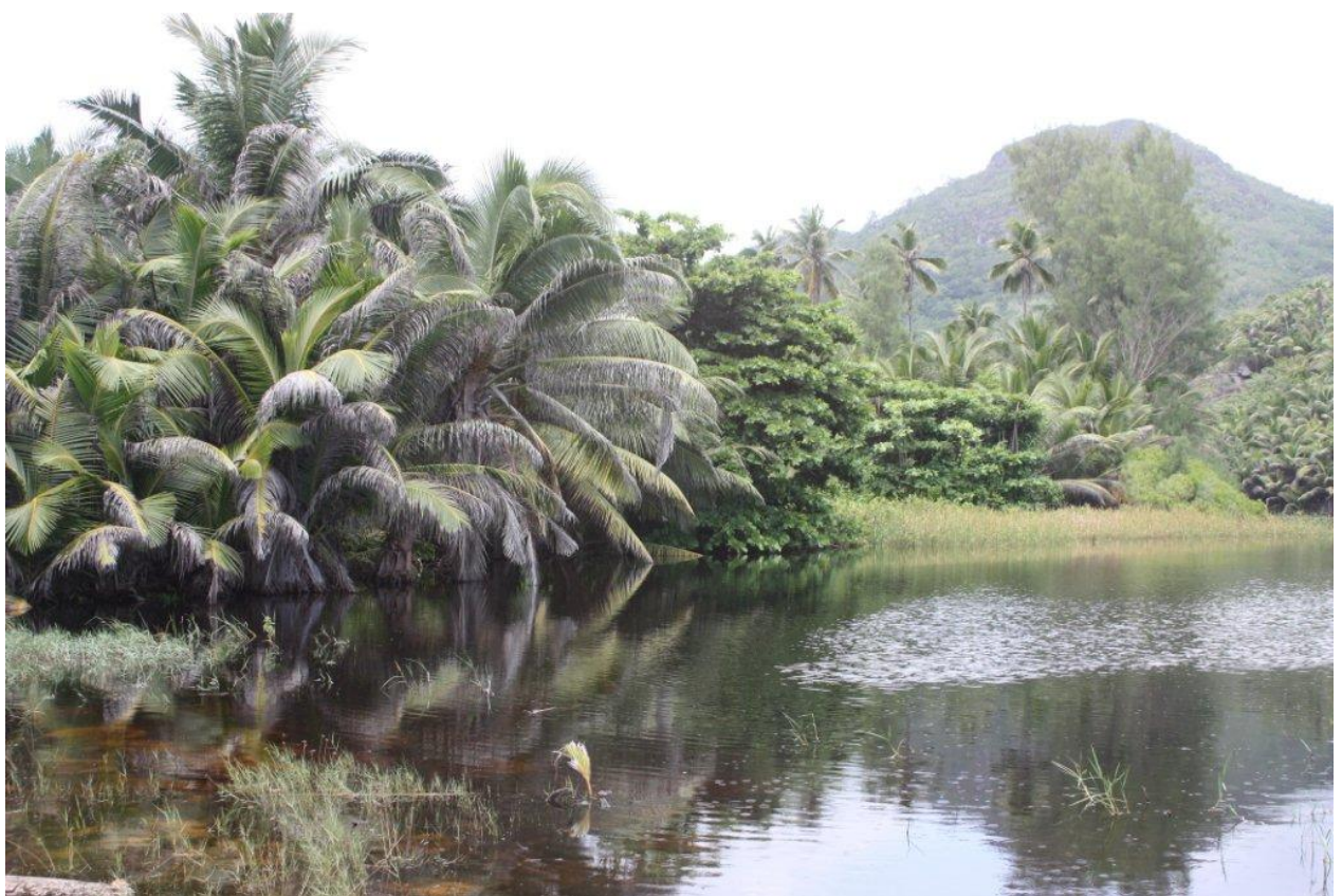
Police Bay Wetland, Mahe Island

Amongst those visited was Anse Royale and Police Bay; both examples of outstanding wetlands aesthetically and in terms of the support they provide to the range of biodiversity reliant upon them. These two wetlands are also of note as it is evident that they are potential designations as Ramsar sites of International Importance and it is intended that this process be completed by the end of the year.