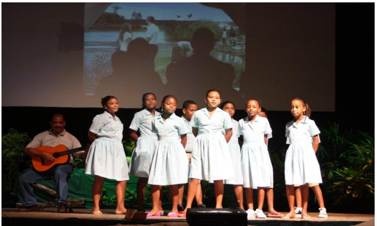
Students of Anse Etoile School calling for all to 'Protect our sky, sea and planet to ensure that it lives on'