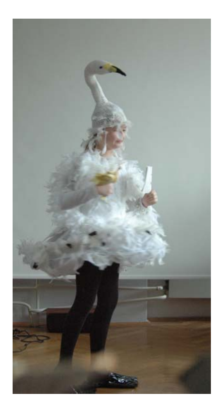
The winner - Whooper swan

All participants' parents were strongly involved in the contest. Additionally, children had to introduce the presented species by a short poem, song or tale. Ideas for disguises were very interesting, creative and beautiful. It was a hard task for the jury to choose the winner. A girl who presented a whooper swan won the contest. The audience chose their own winner, a girl who presented a mallard disguise. All participants were rewarded by a burst of applause.