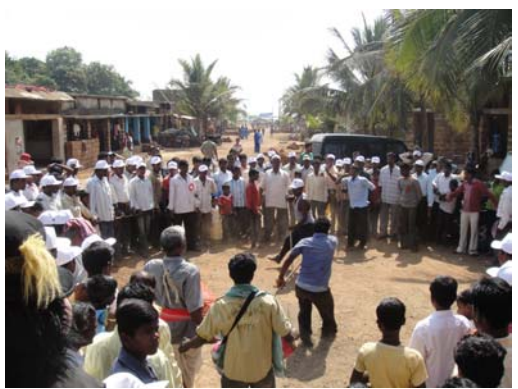
Traditional folk dance during WWD2010

Considering the importance of the theme of the WWD 2010 the school children were involved in a big way. To create awareness about the WWD 2010 among the school children and to sensitize them about the conservation and wise use of wetland resources, essay and debate competitions on