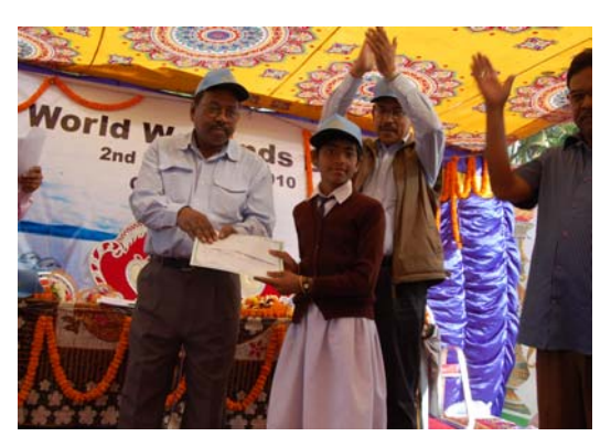
Winner of Drawing Competition receiving award from Chief Guest