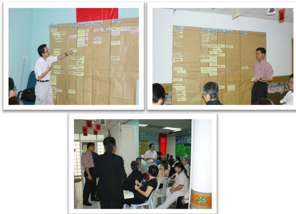
- Group discussion and formulation of Ramsar CEPA action plan-

As a result of the workshop, a detailed action plan of Ramsar CEPA (Ramsar CEPA Matrix) and an action plan for Ramsar Video production were prepared.