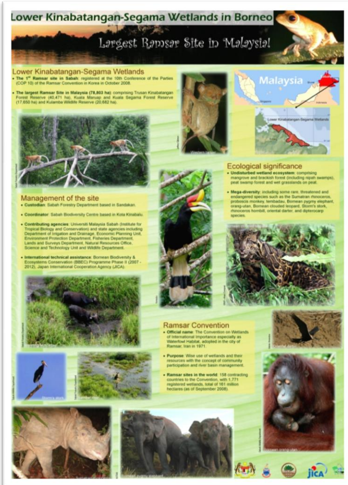
Fig 1. Lower Kinabatangan-Segama Wetlands Ramsar COP10 Poster

From 9 to 11 February 2009, SaBC organized a workshop for management plan of LKSW. In the workshop, the participants discussed and identified conservation targets to be addressed and actions to be taken to achieve the targets. CEPA was one of the four main issues discussed by subgroups in the workshop.