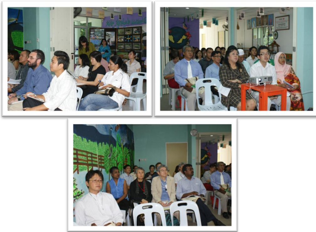
-The Workshop participants-