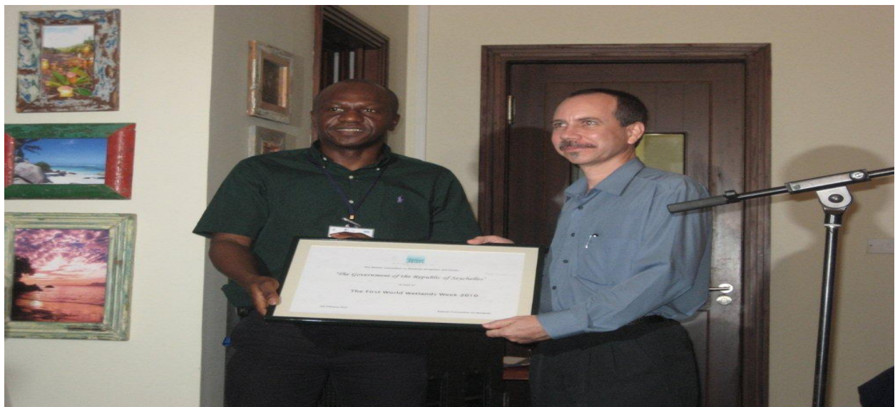
Minister Joel Morgan being presented with a certificate of recognition for the Government of Seychelles by Mr Abou Bamba.

The Government of Seychelles was also presented with a certificate of recognition from the Ramsar Secretariat for the efforts into organizing the weeklong celebration that was inclusive of all stakeholders and allowed for concrete outputs ranging from the “adoption” of the North East Point Wetlands by the Seychelles Scouts Association (SSA) to the real possibility of having a standalone Wetland Section in the Seychelles Environmental Management Plan 2010-2020 (EMPS).