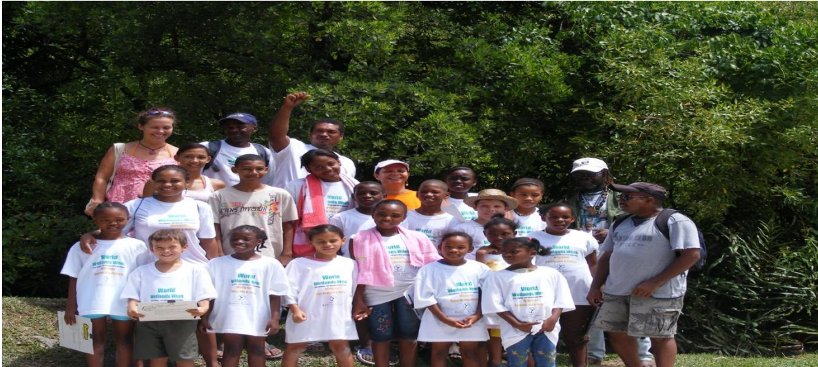
Wetland Safari participants

See appendix 1 for opening and closing speeches.