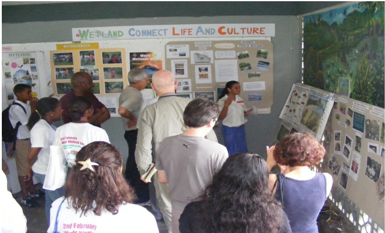
Presentation and discussions on wetland values and functions at Plaisance Secondary school