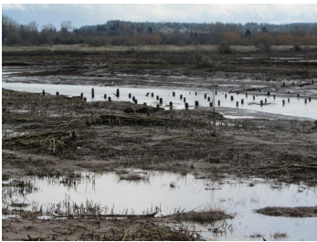
Photo 1: workshop's participants Photo 2: restoration project at Nisqually wildlife refuge.

As part of the STRP's ongoing efforts to evaluate the existing Ramsar guidance on restoration and rehabilitation of lost or degraded wetlands, several regional workshops have been organised to hear from restoration practitioners and policy makers about their experience, gaps and needs.