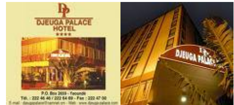
Djeuga Palace Hotel, Yaoundé