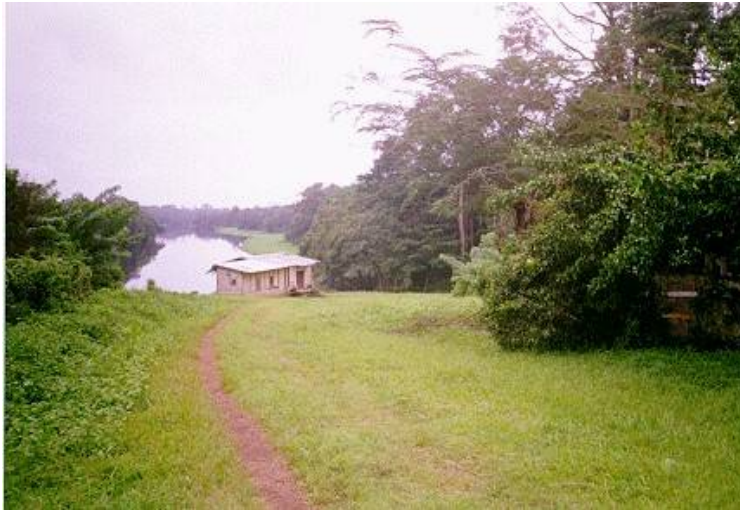
Annex 4.1: Ebogo tourist site

République du Cameroun Paix - Travail - Patrie Republic of Cameroon Peace- Work - Fatherland