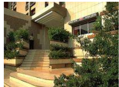
Mecure Hotel, Yaoundé