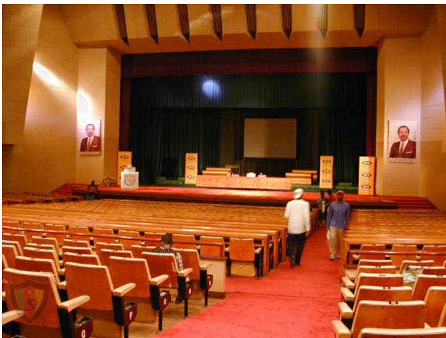
Annex 3.2 :Palais des Congrès - inside view