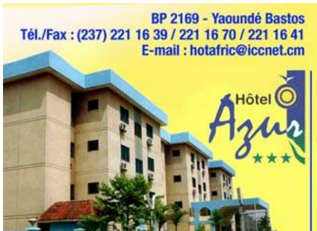
Hotel Azur, Yaoundé

République du Cameroun Paix - Travail - Patrie Republic of Cameroon Peace- Work - Fatherland