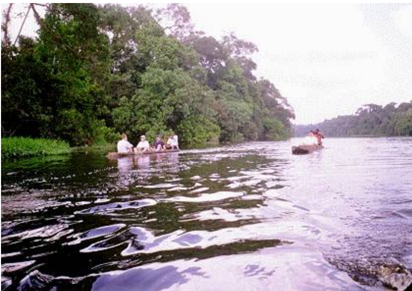
Annex 4.2: Tourism at Ebogo: Canoe trip in River Nyong