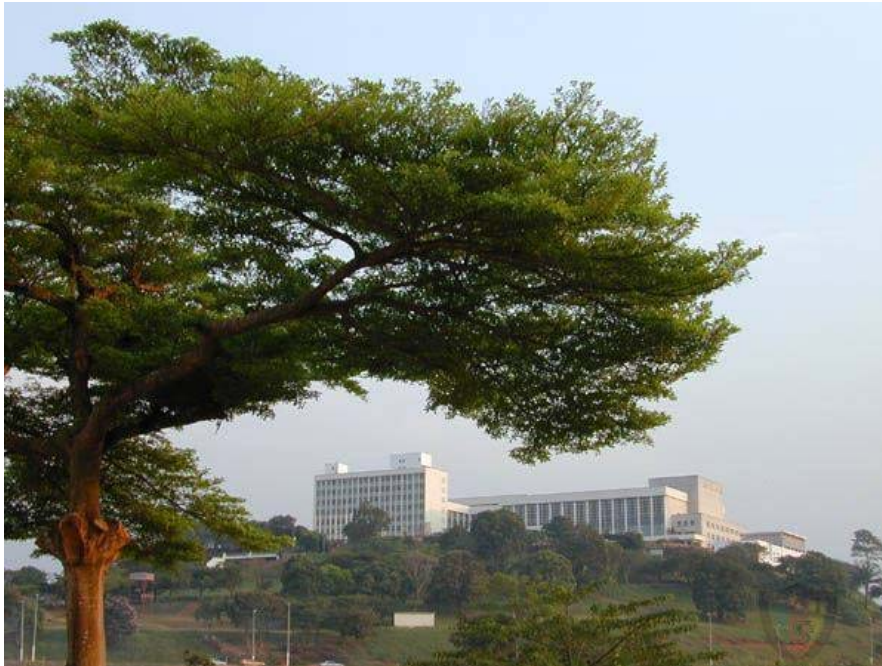
Annex 3.1: Palais des Congrès - outside view

République du Cameroun Paix - Travail - Patrie Republic of Cameroon Peace- Work - Fatherland