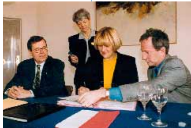
Signature of the Memorandum of Understanding 27 January 1998, Paris

▶ Preparation of the programme according to the objectives of the Ramsar strategic plan