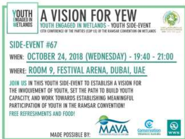
Flyer of the YEW side-event