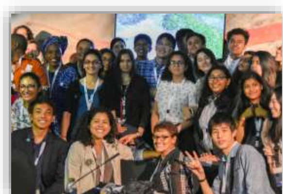
Group picture of side-event attendees

With the backdrop of sounds and images of Australian wetlands provided by Wetland Wander , a celebration of Youth CAN Samoa’s recent Young Wetland Conservation award brought the side-event to a close with many ideas and prospects for Youth Engaged in Wetlands. These discussions then fed into the reflections the next day through the YEW – Visioning Workshop (see page 3).