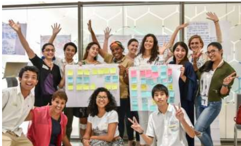
Workshop participants celebrate their commitments