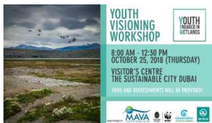
Flyer of the Visioning Workshop