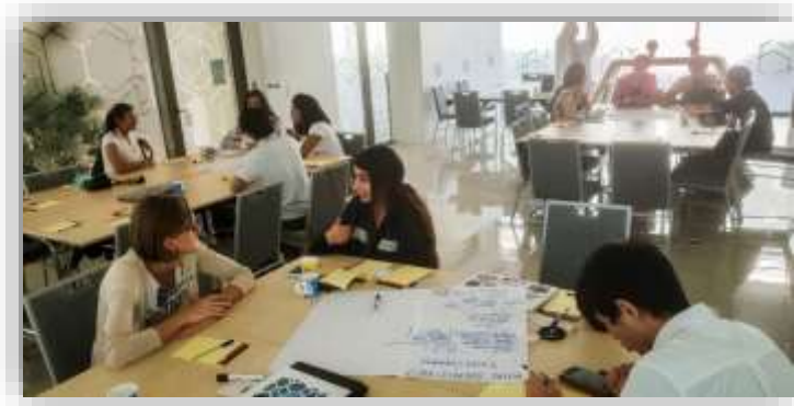
Workshop participants exchanging their ideas around "what should be?" for effective youth engagement in policy making

A report from the workshop is being prepared and will act as a building block for the development of the YEW strategy.