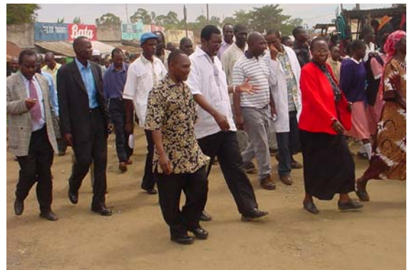
D.G. NEMA and the M.P. Nyando Constituency during the walk procession.

Immediately after arriving in Ahero, all guests and schools present assembled at Ahero Town and made a walk procession through the market to the venue of the event right behind the town. At the front of the procession a banner was displayed that conveyed the message of the event to the public. The guests were welcomed by the Schools Headmaster, after which they went through an exhibition where viewed wetlands products and got lectures on issues that affect them. Other groups also exhibited products covering different aspects of environment.