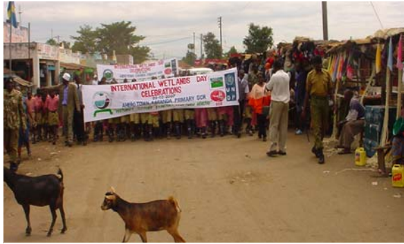
The Walk Procession through Ahero Market.

Immediately after arriving in Ahero, all guests and schools present assembled at Ahero Town and made a walk procession through the market to the venue of the event right behind the town. At the front of the procession a banner was displayed that conveyed the message of the event to the public. The guests were welcomed by the Schools Headmaster, after which they went through an exhibition where viewed wetlands products and got lectures on issues that affect them. Other groups also exhibited products covering different aspects of environment.