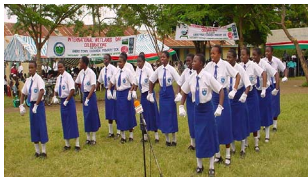
A poem by Rae Girls High School, an ECO School.

The MP for Nyando Constituency blamed the industries for destroying wetlands through pollution of rivers and asked for the matter to be addressed while appreciating their developmental roles. He regretted that Nyando District was endowed vast natural resources and challenged environment professionals to make this a reality as it was in other Countries like Egypt. The D.C. said that if the wetlands were utilized well, then Nyando District which critically deficient in food would turn into a granary. He urged for the protection of wetlands to ensure that fish breeding ground are not