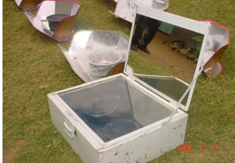
A Solar Cooker displayed during the exhibition.

grounds, catchment area and poor land use in order this valuable resource is not lost. He also decried the high poverty level around the Lake region yet it was endowed a variety of resources. He urged the government to quickly formulate a wetland policy that would ensure the protection of wetlands and aquatic life it sustains.