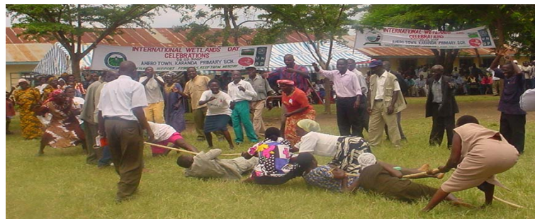
A women's tug of war, one of the entertainment features.