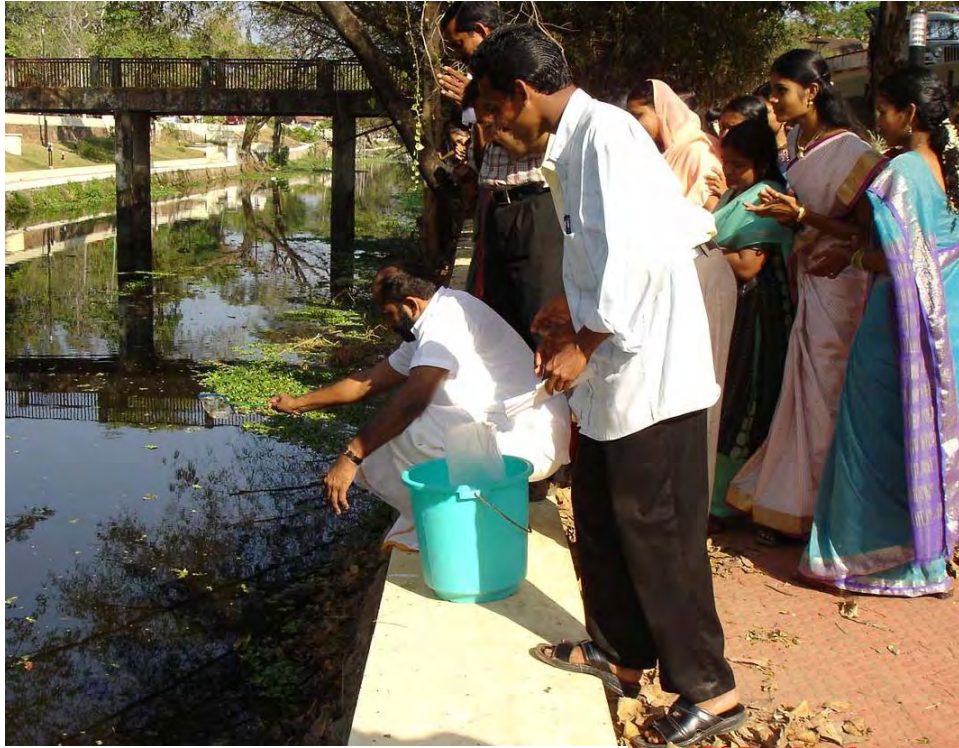
Releasing Fish seedlings