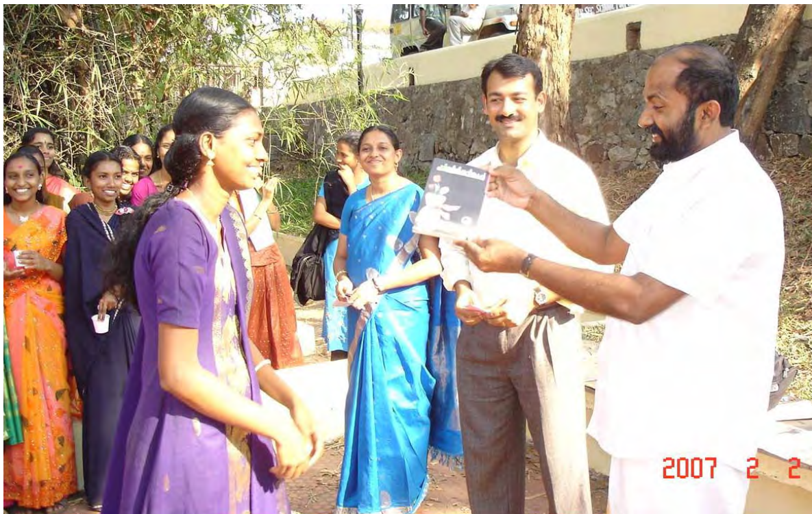
Prize distribution by the chief Guest