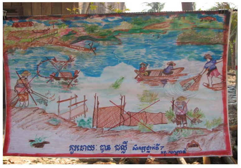
Appendix 2: Photos of selected students' results and of the event