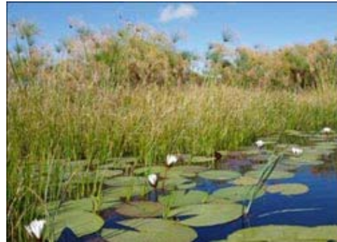
Vegetation of the Okavango River

The day is commemorated to raise awareness and promote the wise use of our wetland, to draw attention to the values and benefits that we derive from our wetlands and to enhance the peoples understanding and shared responsibility for wetlands. Wetlands provide us with natural resources such as the water we drink and use in agriculture, industries, etc., the vegetation we use as food, medicines, building material, etc., the animals, such as marine and freshwater fish that we eat and other wildlife that congregates around wetland areas, and we carry out agricultural activities on floodplains since the sediments deposited in floodplains are rich in nutrients. Wetlands also provide us with essential ecological services such as attenuation of floods, erosion prevention, underground water recharge, water quality improvement, climate stabilisation and the formation of linear oases in arid areas.