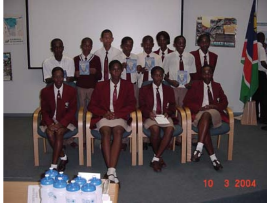
The team of Concordia College

The one in Mariental was contested by Mariental High School and Empelheim Junior Secondary School and the former came out victorious. The next school quiz will be held in Rundu on 15 th March 2004 and will be contested by Sauyemwa Combined School, Leezi Hakusembe Senior Secondary School and Maria Mwingene Senior Secondary School.