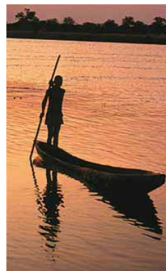
A wetland at work