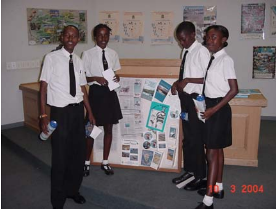
The team of Augustineum

School quizzes have been planned between different schools as activities for this year's joint commemoration of World Wetlands Day – World Water Day and each participating team consisted of four learners from a school targeting grade 8's and 9's. The activities started with a school quiz at the coast on 2 nd February 2004, which was contested by Duneside High School, Westside High School and Kuisebmond High School and Duneside came out victorious. This was followed by school quizzes in Windhoek and Mariental on 10 th March 2004. The school quiz in Windhoek was contested by St. Pauls College, Augustineum Senior Secondary School and Concordia College, and Augustineum was the winner.