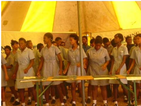
Empelheim Junior Secondary School in action