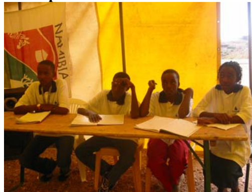
Augustineum Secondary School the winning team from Windhoek during the Hardap