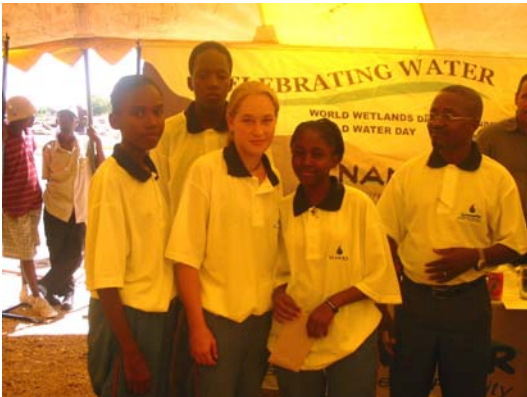
Mariental High School the winning team from Mariental during the Hardap debate