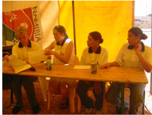
Westside High School the winning team from the coast during the Hardap debate

After arrival at the resort the learners were treated with a welcoming braai and the programme of the next days' activities was also distributed upon arrival.