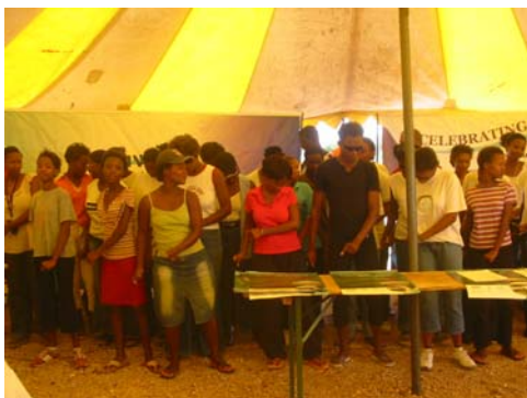
The Catholic Youth Church Choir doing their thing

The first round of school debates started with Maria Mwengere Senior Secondary School taking on Westside High School