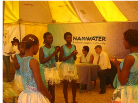
Oshiwambo Cultural Group performing cultural dance and song

debating whether water should be free rather than paid for, and Westside High School who argued that it should be paid for came out victorious.