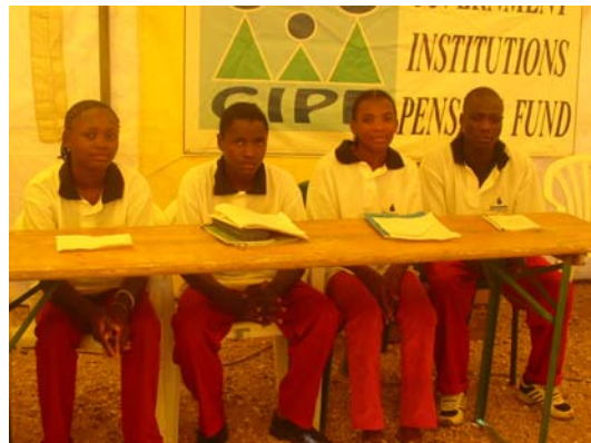
Maria Mwengere Senior Secondary School the winning team from Rundu during the Hardap debate

The next morning after breakfast they departed to Mariental to attend the Independence celebration on invitation by Her Worship, The Mayor of Mariental.