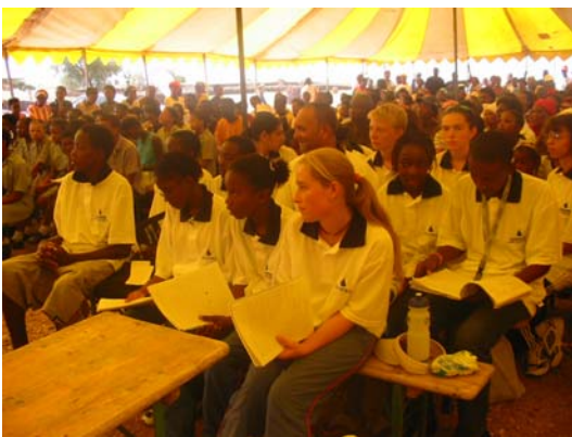
The huge crowd which turned up for the event at Hardap with the debating teams in the foreground

Monday, 22 March dawned and people from Mariental flocked to Hardap Recreation Resort to attend the joint commemoration of World Wetlands Day and World Water Day. It was previously anticipated that not more than one hundred people could be attending since the day was a public holiday and more people could have been out on holiday elsewhere, only to experience a huge turnout of more than three hundred people at the event.