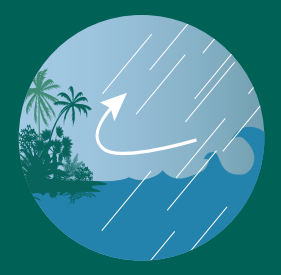
Reduce storm surges and protect coastlines