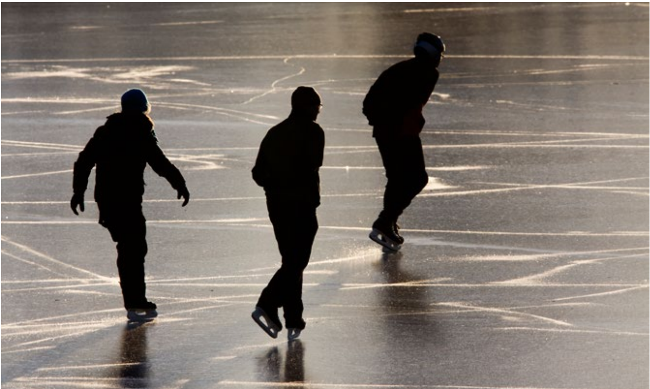
Frozen water can provide great experiences on ice-skates in the winter.

Central actors: Environmental protection management at a national level, county level and municipal level.