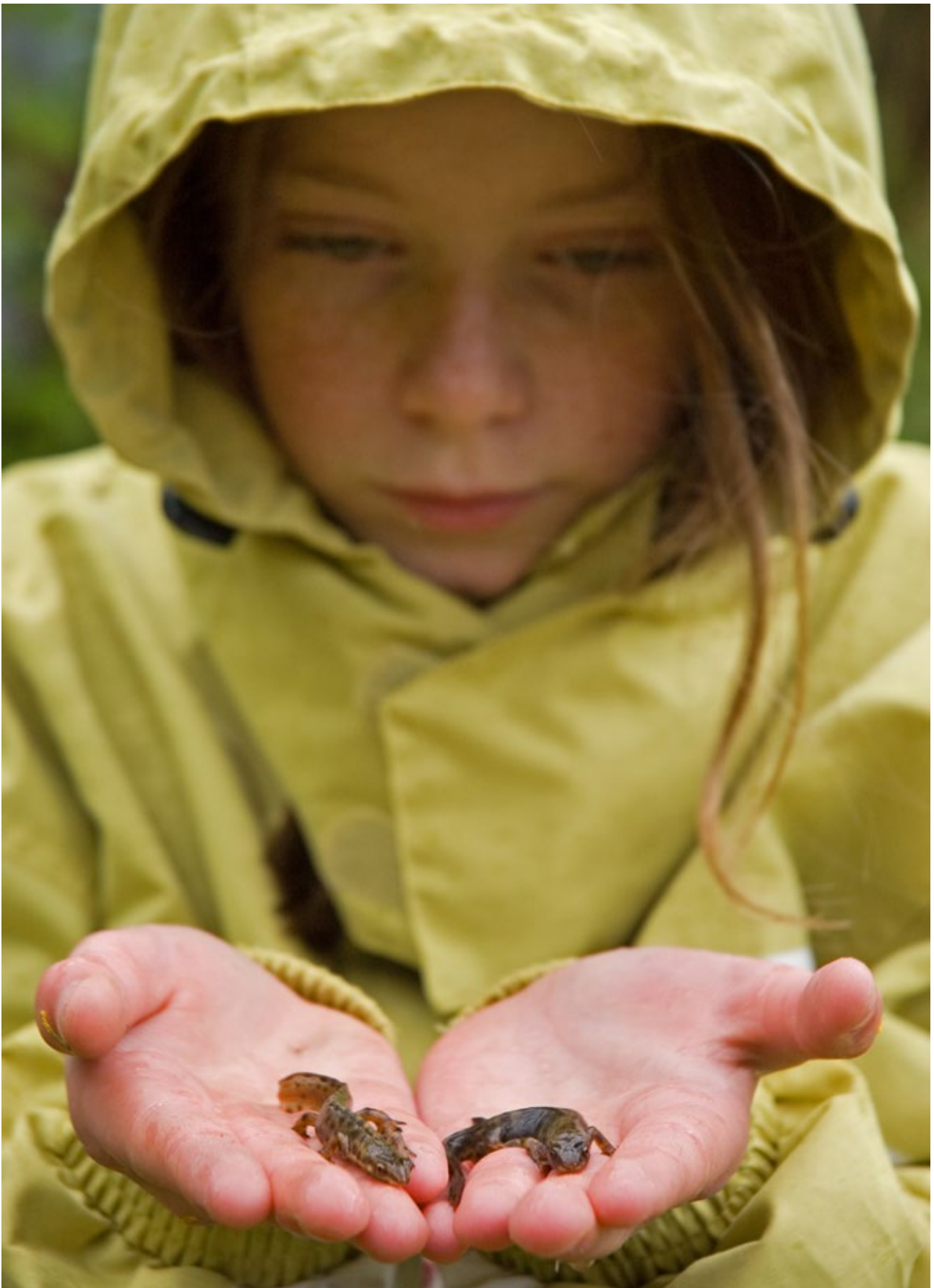
Nature has the ability to fascinate children and adults alike. A girl has caught two small salamanders ( Triturus vulgaris ) which are listed as close to being endangered on the Red List from 2010.