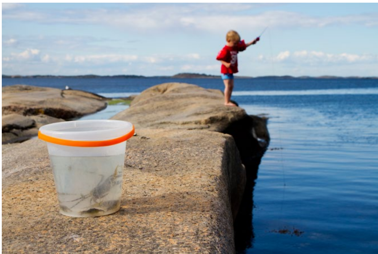
Catching crabs along the coast is an exciting activity for small children on hot summer days.

Target groups: The information package ought, as a whole, to be aimed at reaching a wide selection of target groups, and the different parts of the information package should be adapted to each target group.