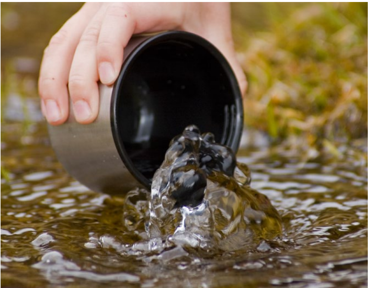
In Norway we are lucky and can drink clean water from streams and lakes when we are outside.

Reason: The environmental protection and land management have a central role in ensuring the protection and sustainable use of wetlands in and outside protected areas. It is important that persons who work with land use in public management have sufficient knowledge to carry out their meaningful role. The group believes therefore that it is appropriate to invest in strengthening their knowledge basis on wetlands.