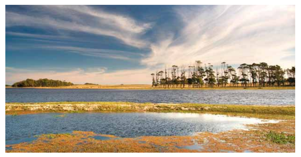
Laguna de Rocha Ramsar Site in Uruguay, part of a complex of coastal wetlands on the Atlantic coast.

UNESCO system of environmental conventions and agreements. The Convention is responsible only to its Conference of the Contracting Parties (COP), and its day-to-day administration has been entrusted to a Secretariat under the authority of a Standing Committee elected by the COP. The Ramsar Secretariat is hosted under contract by IUCN-the International Union for Conservation of Nature in Gland, Switzerland.