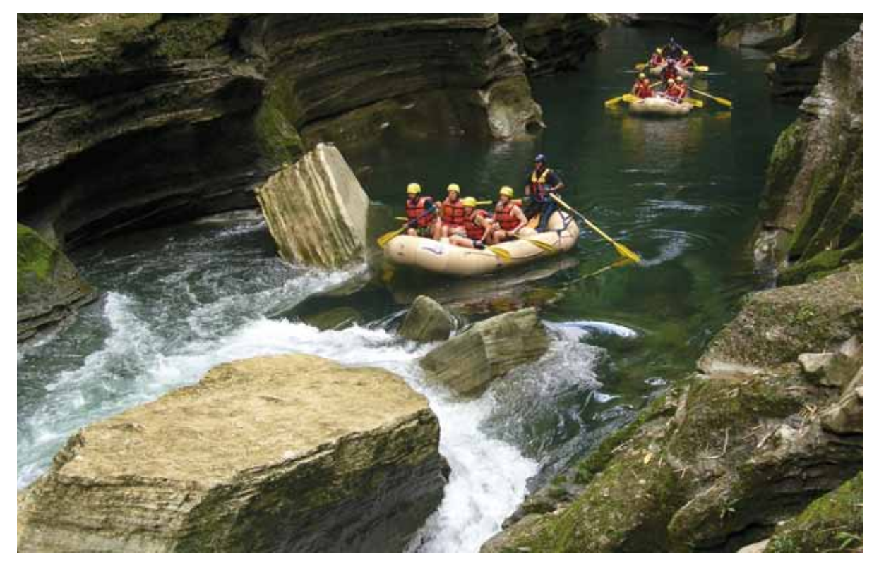
The Upper Navua Conservation Area Ramsar Site in Fiji. The Upper Navua River cuts a deep gorge in the central highlands of Viti Levu, the main island. The Site hosts important fauna and flora.

The core budget for the triennium 2016-2018 is Swiss francs 5,081,000 (ca. US$ 4.9 million or \\mathbb{C} 4.7 million at December 2015 exchange rates) per calendar year.