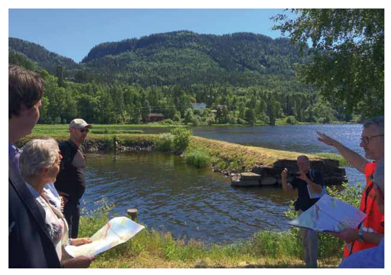
A Ramsar Advisory Mission in July 2015 to the Nordre Tyrifjord Wetlands System Ramsar Site in Norway.

In addition, in accordance with Article 8.2 of the Convention, the Ramsar Secretariat has the responsibility to inform the other Contracting Parties of "any alterations to the List or changes in character of wetlands included therein", and to arrange for these matters to be discussed at the next meeting of the Conference of the Parties. All substantive Article 3.2 reports and responses to them are therefore communicated by the Secretary General to the COP, which may wish to offer its own advice in the form of a COP Resolution or Recommendation.