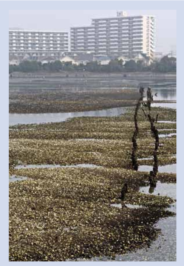
Yatsuhigata Tidal Flats, Tokyo Bay, Japan