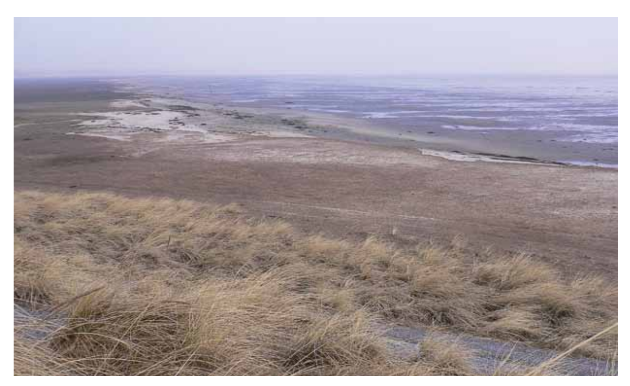
Wadden Sea is a Transboundary Ramsar Site covering 13 Ramsar Sites in Denmark, Germany and the Netherlands.