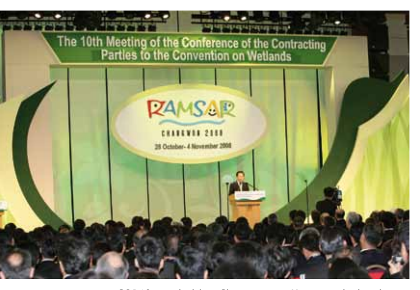
COP10 was held in Changwon in Korea with the theme Healthy Wetlands Healthy People

The Proceedings of all of the meetings of the Conference of the Parties have been published on the Ramsar website, with additional materials, including photographs, for recent meetings.