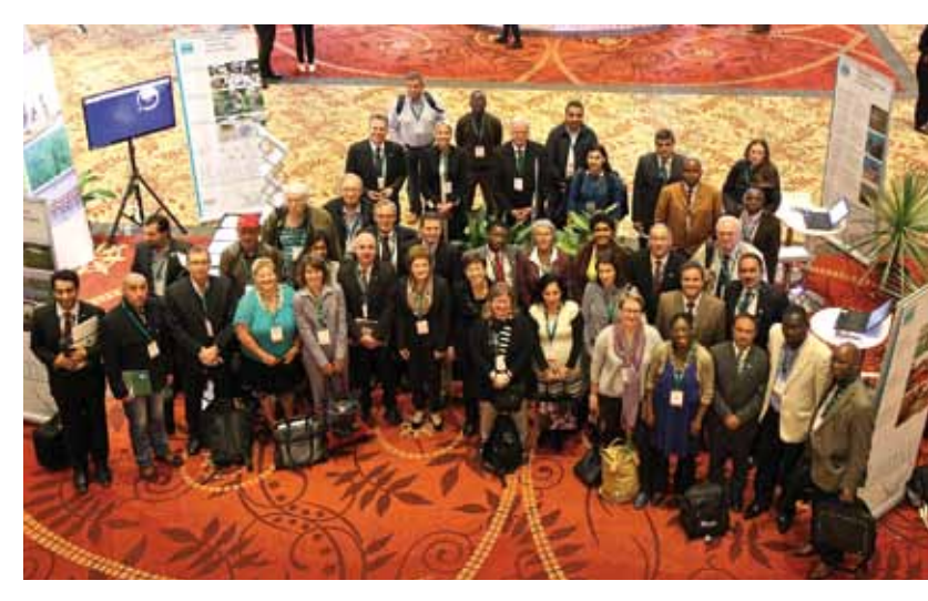
The Standing Committee oversees Convention affairs and the activities of the Secretariat, on behalf of the Conference of the Contracting Parties (the COP), between its three-yearly meetings.

The Standing Committee normally meets once each year, traditionally at the offices of the Secretariat in