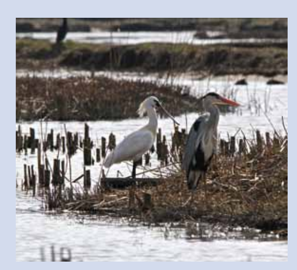
Black Faced Spoonbill

Criterion 1: A wetland should be considered internationally important if it contains a representative, rare, or unique example of a natural or near-natural wetland type found within the appropriate biogeographic region.