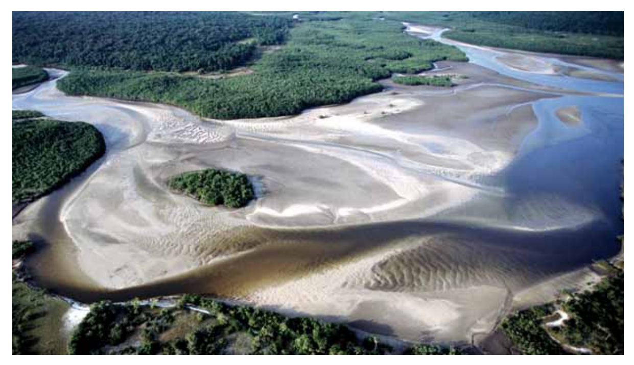
Archipel Bolama-Bijagos Ramsar Site in Guinea-Bissau. The Convention established six geographical regions: Africa, Asia, Europe, Latin America and the Caribbean, North America, and Oceania.

Committee based upon nominations from the Administrative Authorities of Contracting Parties, but they serve in their own capacities as experts in the scientific and technical areas covered by the STRP's Work Plan and not as representatives of their countries or governments. Resolution XII.5 (2015) approved a new framework for delivery of scientific and technical advice and guidance under the Convention, replacing the earlier modus operandi established under Resolution XI.18 (2012).