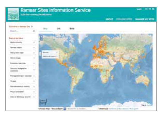
The Ramsar Sites Information Service (RSIS) presents information on more than 2,200 Ramsar Sites.

provide essential data to everyone conducting research on one or many wetlands or developing global or national inventories of wetlands.