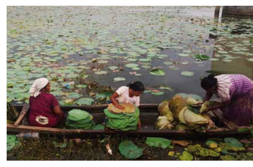
Women in India collecting leaves and flowers of lotus to sell in the market for their livelihoods as example of wetlands wise use. Wetlands are essential for the sustainable livelihood of millions of people around the world.

To assist the Parties in implementing the wise use concept, the Wise Use Working Group, established at Regina, developed Guidelines for the implemen tation of the wise use concept , which were adopted by the 4<sup>th</sup> COP in Montreux, Switzerland, in 1990.