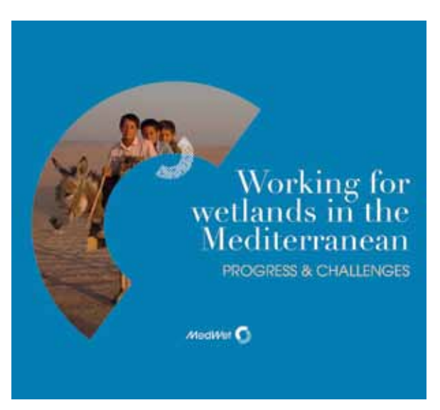
The Mediterranean Wetlands Initiative (MedWet) brings together 26 Mediterranean and peri-Mediterranean Contracting Parties to the Convention.

Following on from the success of MedWet and the development of the CREHO Ramsar Center in Panama (§4.5.2 below), the Parties, meeting in Valencia in 2002, established Guidelines in Resolution VIII.30 and encouraged the proposal of additional initiatives for endorsement and possible financial support. Through Resolutions at each of the next four COPs - namely Resolutions IX.7 (2005), X.6 (2008), XI.5 (2011), and XII (2015) - the Parties formally endorsed a variety of regional cooperation platforms as "Ramsar Regional Initiatives". As of December 2015 there are four Ramsar Regional Centres for training and capacity building: the Ramsar Regional Center for Training and Research on Wetlands in the Western Hemisphere (CREHO) in Panama, the Ramsar Regional Center for Training and Research on Wetlands in Western