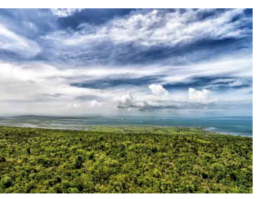
Portland Bight Wetlands and Cays Ramsar Site in Jamaica.

change in wetland ecological character (Resolution X.16, 2008; both in Handbook 15) provide guidance for designing wetland inventories at multiple scales from site-based to provincial, national and regional.