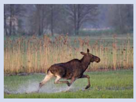
Young moose in the Biebrzanski National Park and Ramsar Site in Poland

Criterion 9: A wetland should be considered internationally important if it regularly supports 1% of the individuals in a population of one species or subspecies of wetland-dependent non-avian animal species.