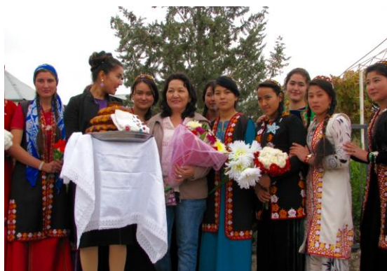
During the field trip the participants were warmly welcomed by the local authority and schoolchildren of the village.

The workshop was opened by welcoming speeches from the Government of Tajikistan, Embassy of Japan in Tajikistan, and the Ramsar Secretariat.