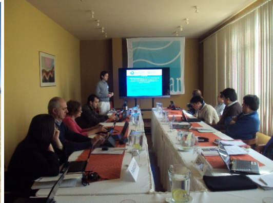
Participants in Tarija, Bolivia 2013