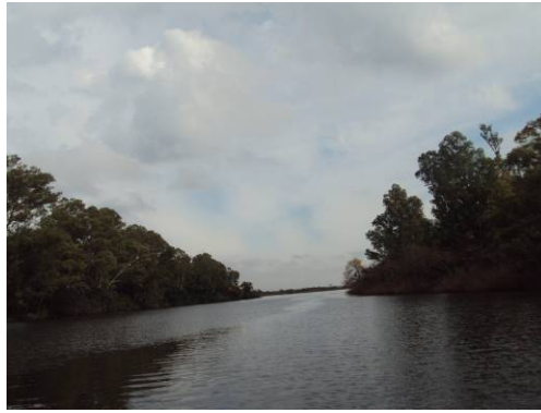
View of the Uruguay River