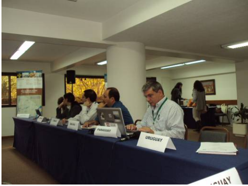
II Meeting, Montevideo Uruguay