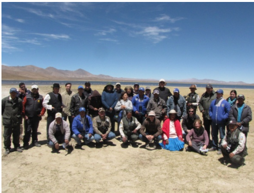
Participants visiting the Ramsar Site in Tajzara, Bolivia