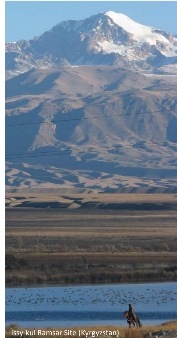
Issy-kul Ramsar Site (Kyrgyzstan)