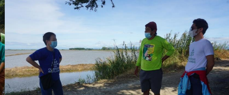
Engage local communities in wetland conservation through various activities, ie Citizen Science (Wetlands BioBlitz), Youth Eco-Camps, Wetland Centre Design Competition