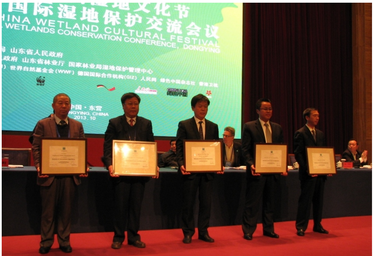
Managers of the new Ramsar Sites receiving their Site certificates.