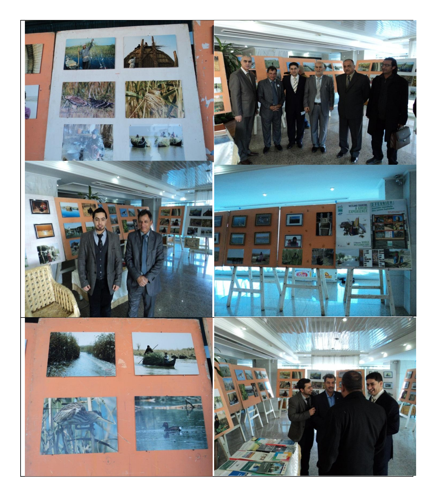
Different Photos of the exhibition held by the Nature Iraq at the celebration