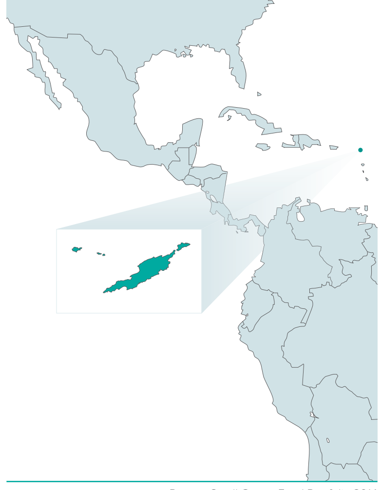
Ramsar Small Grants Fund Portfolio 2014