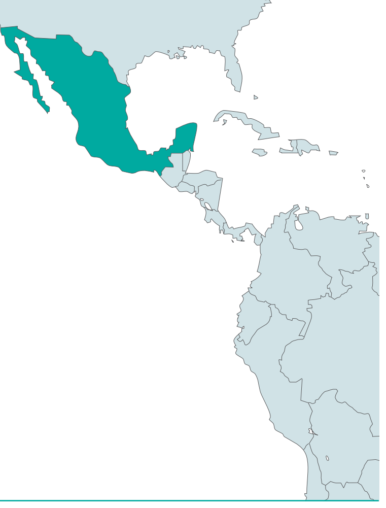
Ramsar Small Grants Fund Portfolio 2014