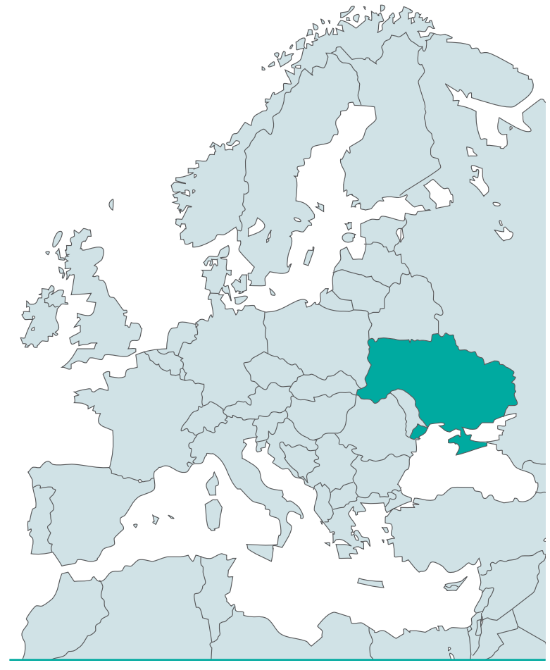
Ramsar Small Grants Fund Portfolio 2014