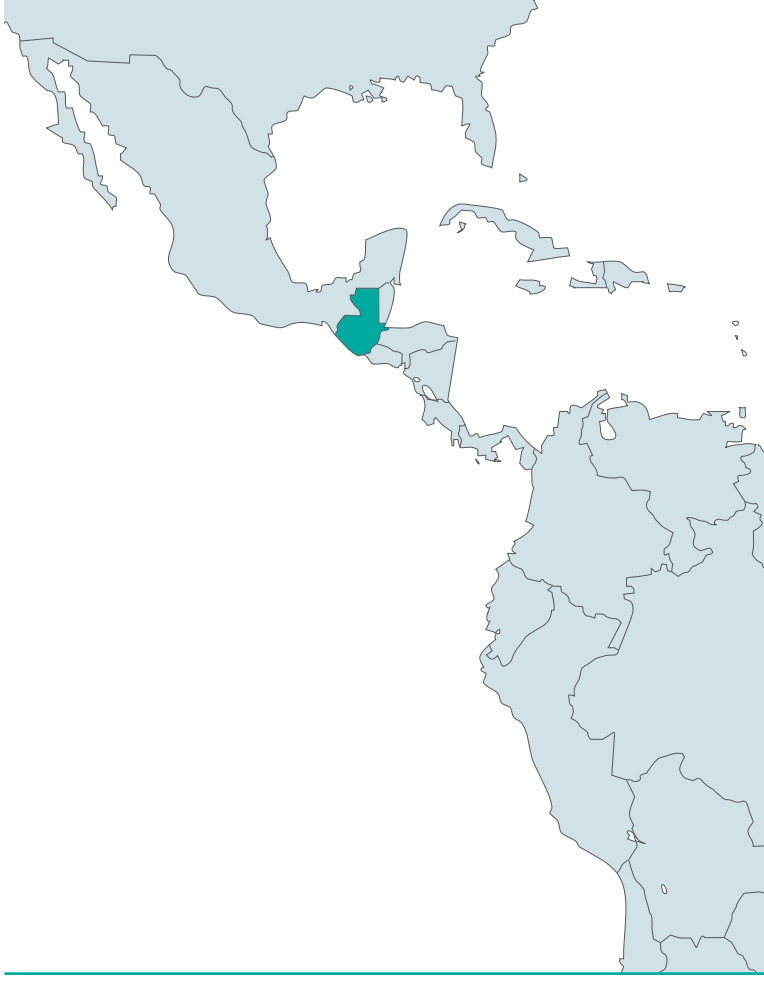
Ramsar Small Grants Fund Portfolio 2014