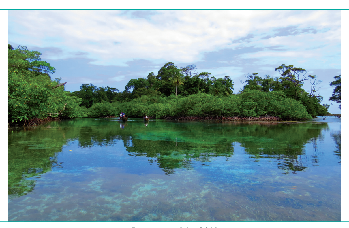
Project portfolio 2014