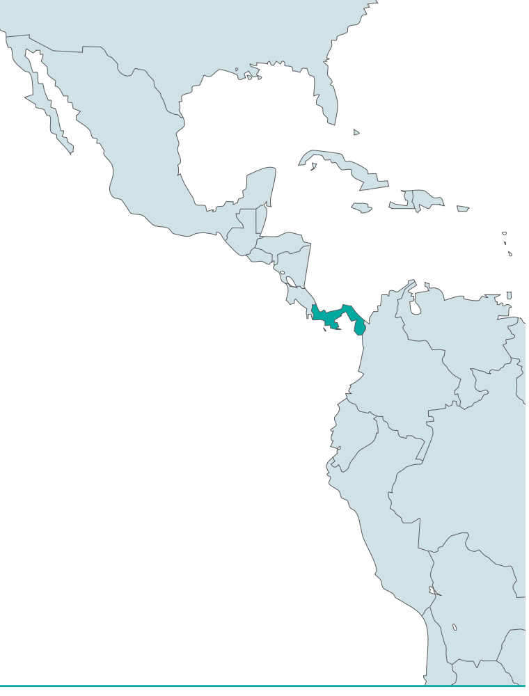
Ramsar Small Grants Fund Portfolio 2014