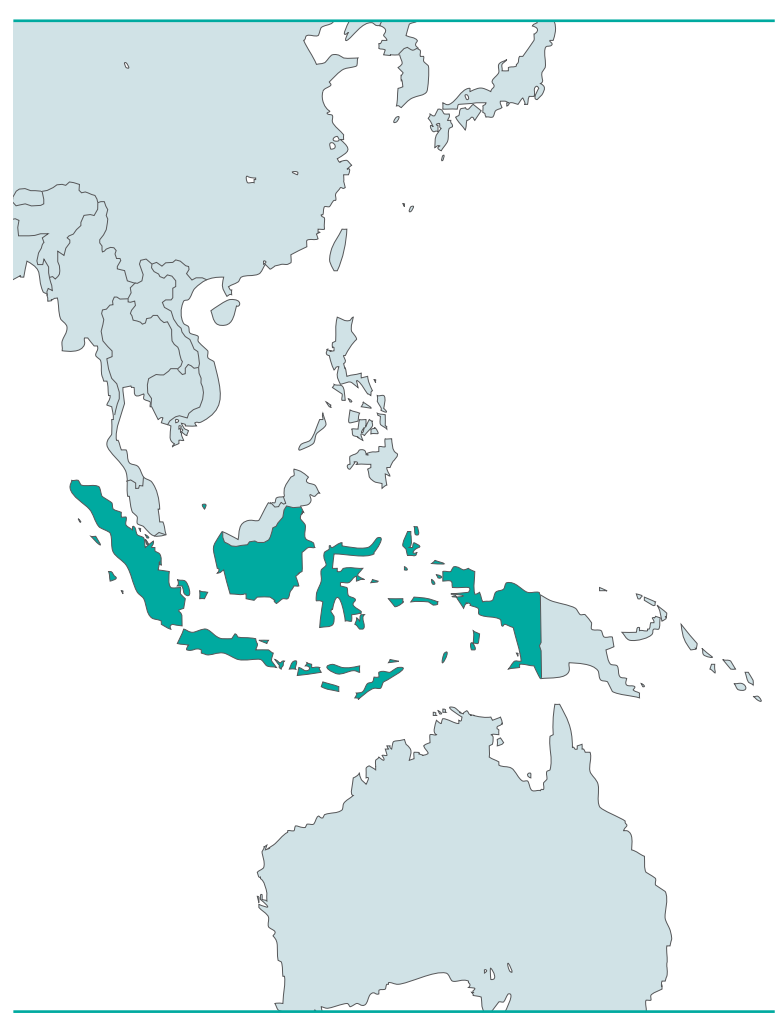
Ramsar Small Grants Fund Portfolio 2014