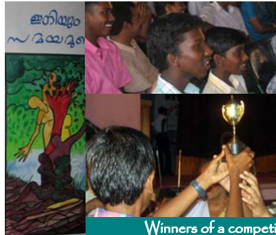
Winners of a competition