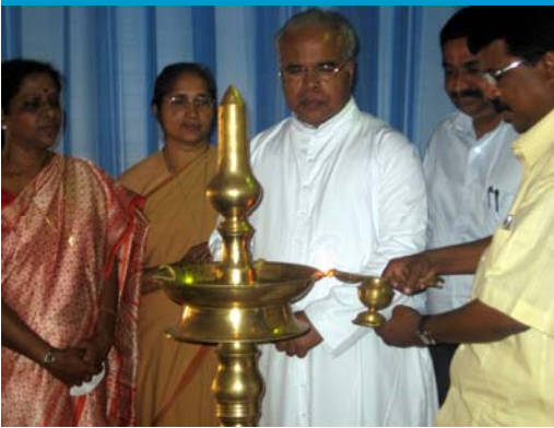
Inauguration of Wetland Festival - 2008