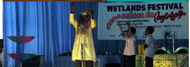
Magic Show on ‘Water and Wetlands’