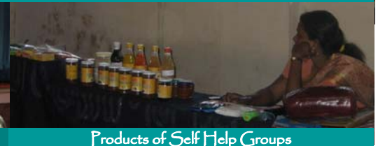
Products of Self Help Groups