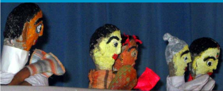
Puppet Show on Wetland Conservation

A puppet show with wetland conservation as the theme was an attraction of the Wetland Festival. Conceived, created and performed by members of Wetland study Center, Govt. TTI Alappuzha, the story centered on the environmental deterioration of the Vembanad socio-ecological system. The 15 minutes show was successful in highlighting the deterioration of the lake and affected livelihoods. Puppet show as a strong and interesting media inspire us to organize further workshops on puppet making/show for the students to propagate conservation message. The puppet show concluded stating that there are chances of hope as long as we have dedicated organizations like ATREE.