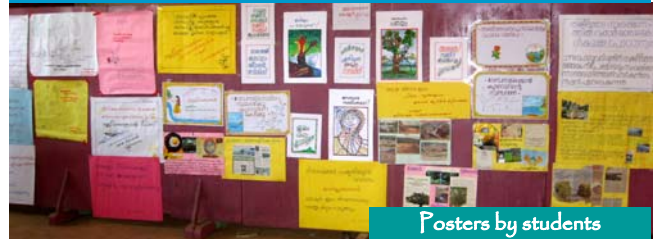
Posters by students