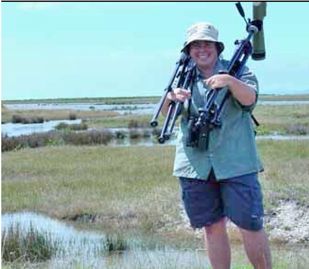
Carrying telescopes to Thames chenier plains