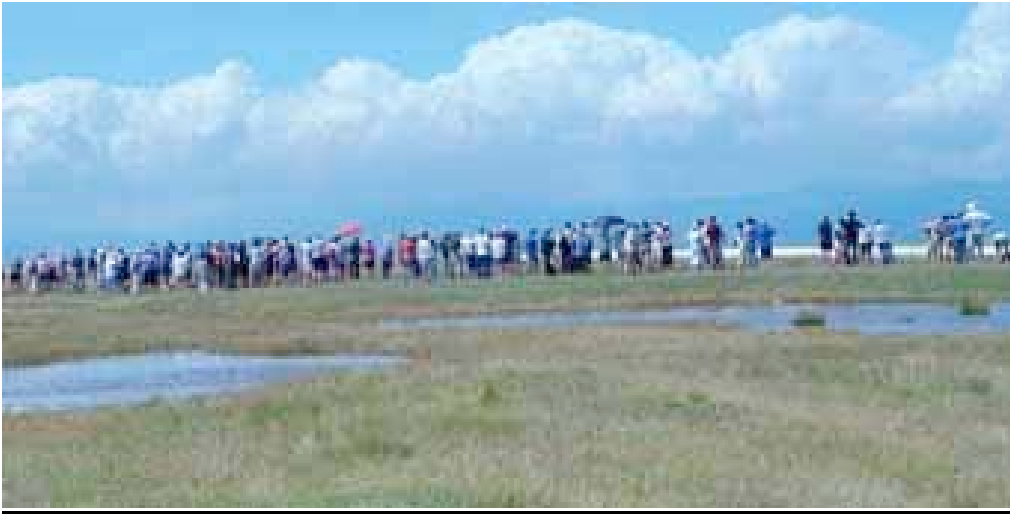
Lineup of people looking at shorebirds feeding in Thames estuary