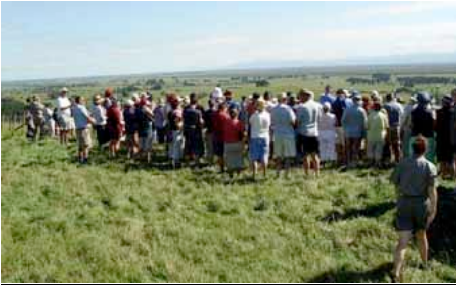
Lineup of people at the Tahuna Hill stop to view Flax Block & Kopuatai