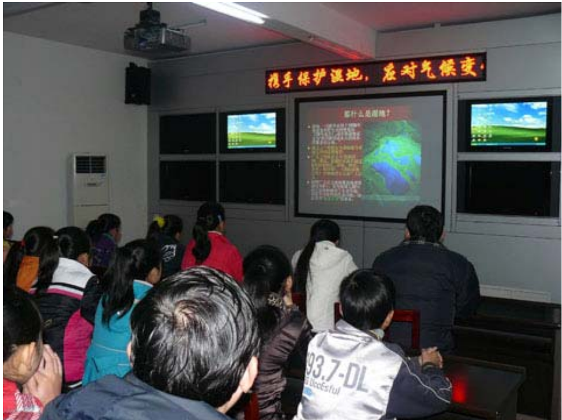
Activities for WWD 2010 in Poyang Lake Ramsar site, Jiangxi