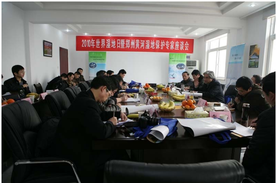
Activities for WWD 2010 in Yellow River wetland, Henan