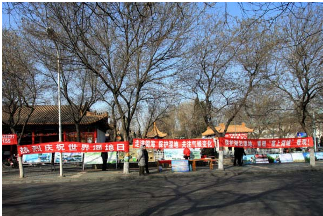
Activities for WWD 2010 in Yuehai national wetland park, Ningxia