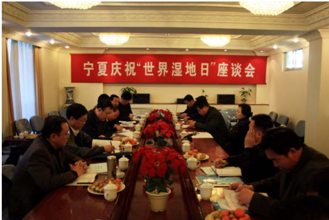
Ningxia Autonomous Region held symposium for WWD 2010