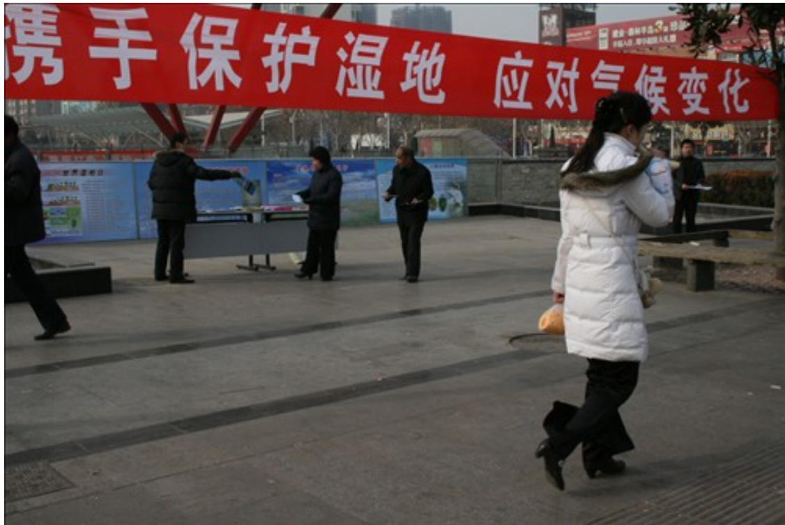
Activities for WWD 2010 in Sanmenxia wetland, Henan