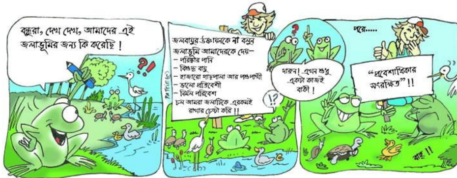
WWD2010 Sticker for children from CNRS, Bangladesh