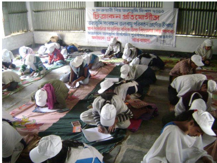
Children engrossed during the World Wetland Day 2010 Art Competition in Nakalia -Sharasia Banik High School, Bera, Pabna, Bangladesh organized by CNRS

The local important personalities being present in the event encouraged the locals on the importance of the day. Both local and national electronic and print media covered the event.