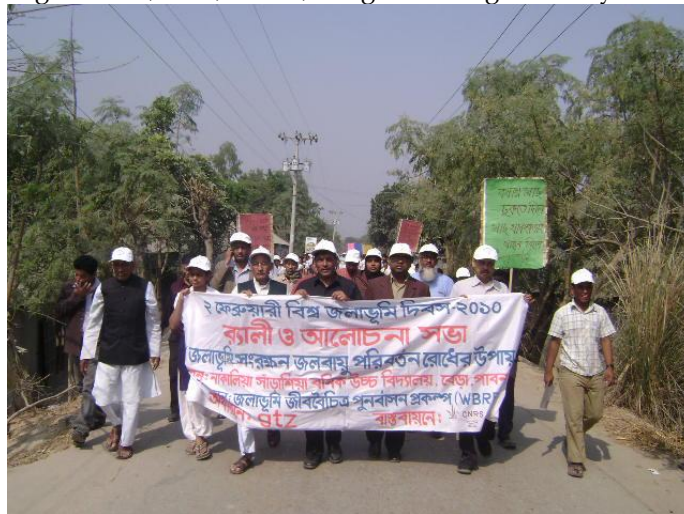
The World Wetland Day 2010 rally in Bera, Pabna organized by CNRS