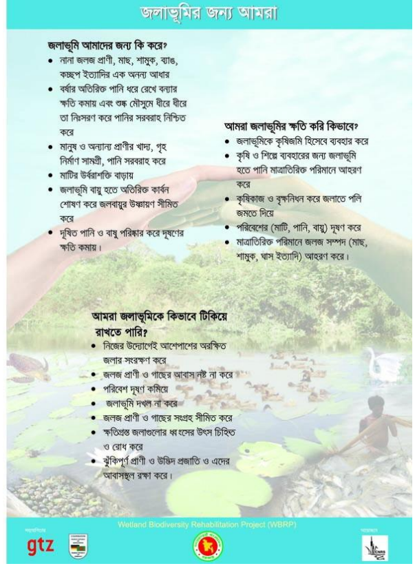
Leaflet for WWD2010 from CNRS, Bangladesh