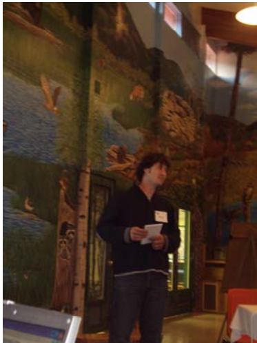
The main topics discussed with the participants were the Ramsar Convention and site managers, Criteria for wetlands of international importance, Ramsar Information Sheets, guidelines for management planning, national wetlands committees and CEPA Program