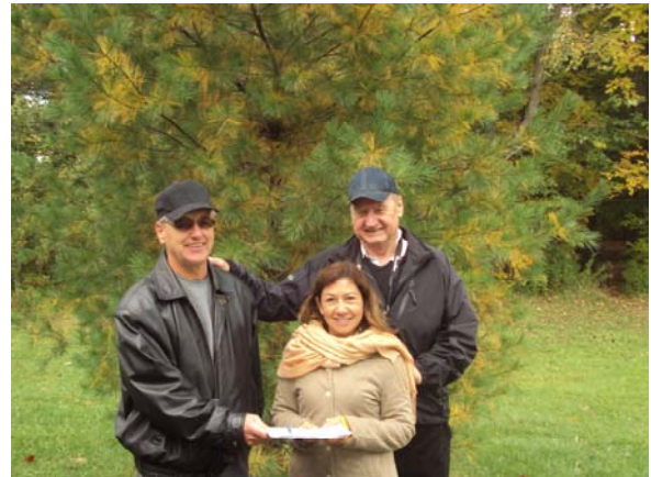
The friends of Mer Blue "The friends of Mer Blue are a volunteer group of local community citizens concerned about the natural environment and habitat. We support public education , good management practices and overall environment protection of the Mer Blue and surrounding areas