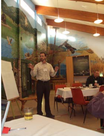
27 delegates from across Canada participated in a variety of presentations, group panels and discussions and hand on exercises.