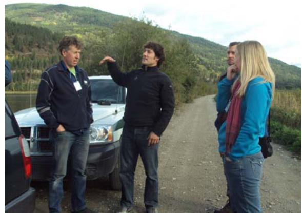
Participants discussing specific topics about the management of Creston Valley Wildlife Management Area during the field trip